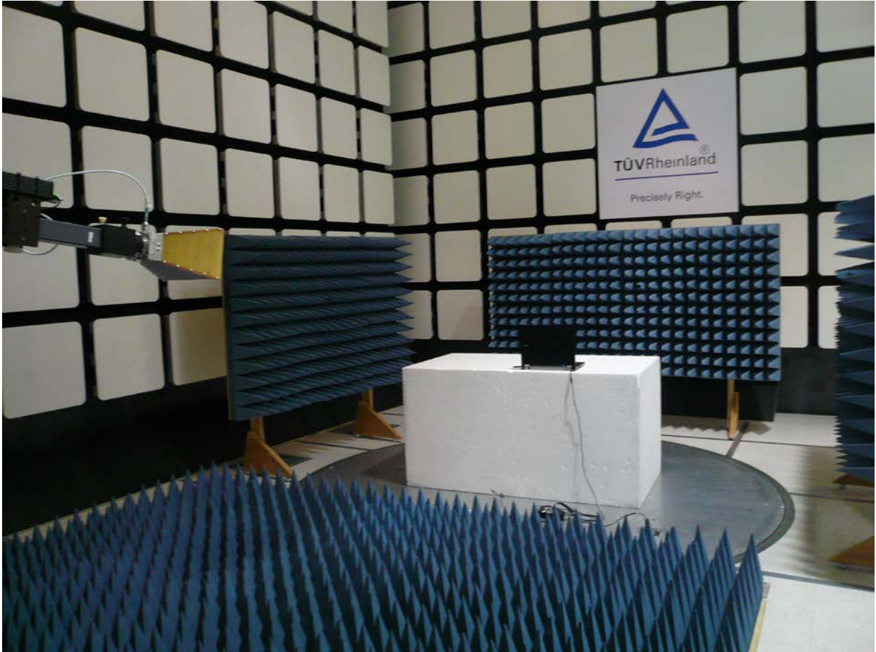
Figure 4: Test Setup for 1GHz to 18GHz (Rear View) – Y-Axis