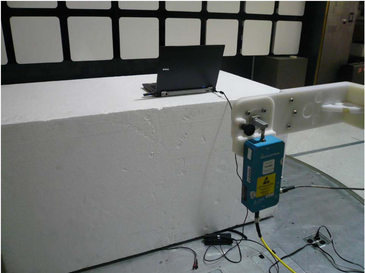
Figure 6: Test Setup for 18 GHz to 26GHz (Rear View) - Y-Axis