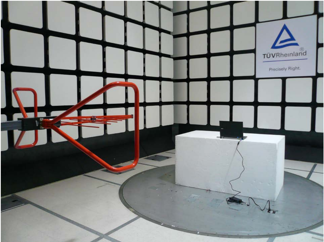
Figure 2: Test Setup for 30 MHz to 1000MHz (Rear View) – Y-Axis