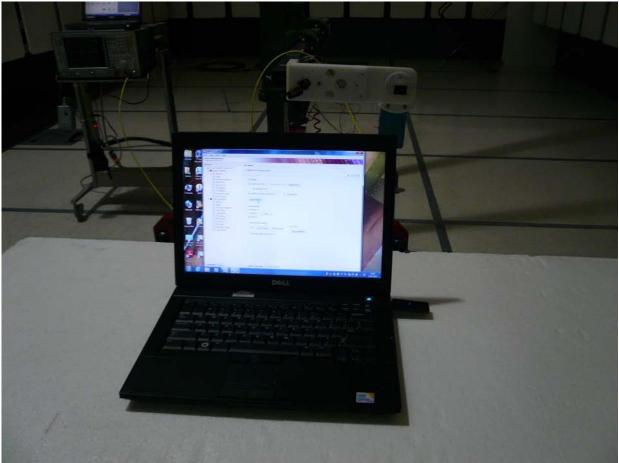
Figure 5: Test Setup for 18 GHz to 26GHz (Front View) – Y-Axis