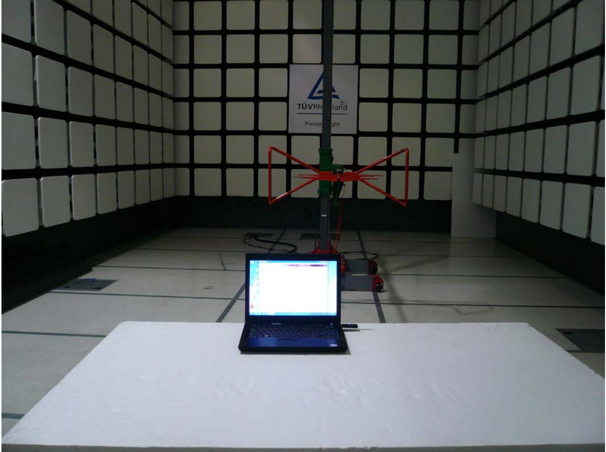
Figure 1: Test Setup for 30 MHz to 1000MHz (Front View) – Y-Axis