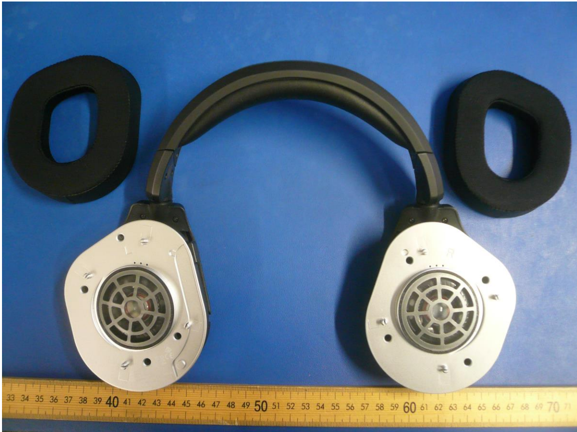
Figure 1: Internal Photo of Stealth 700X Gen 2 without Ear Cover