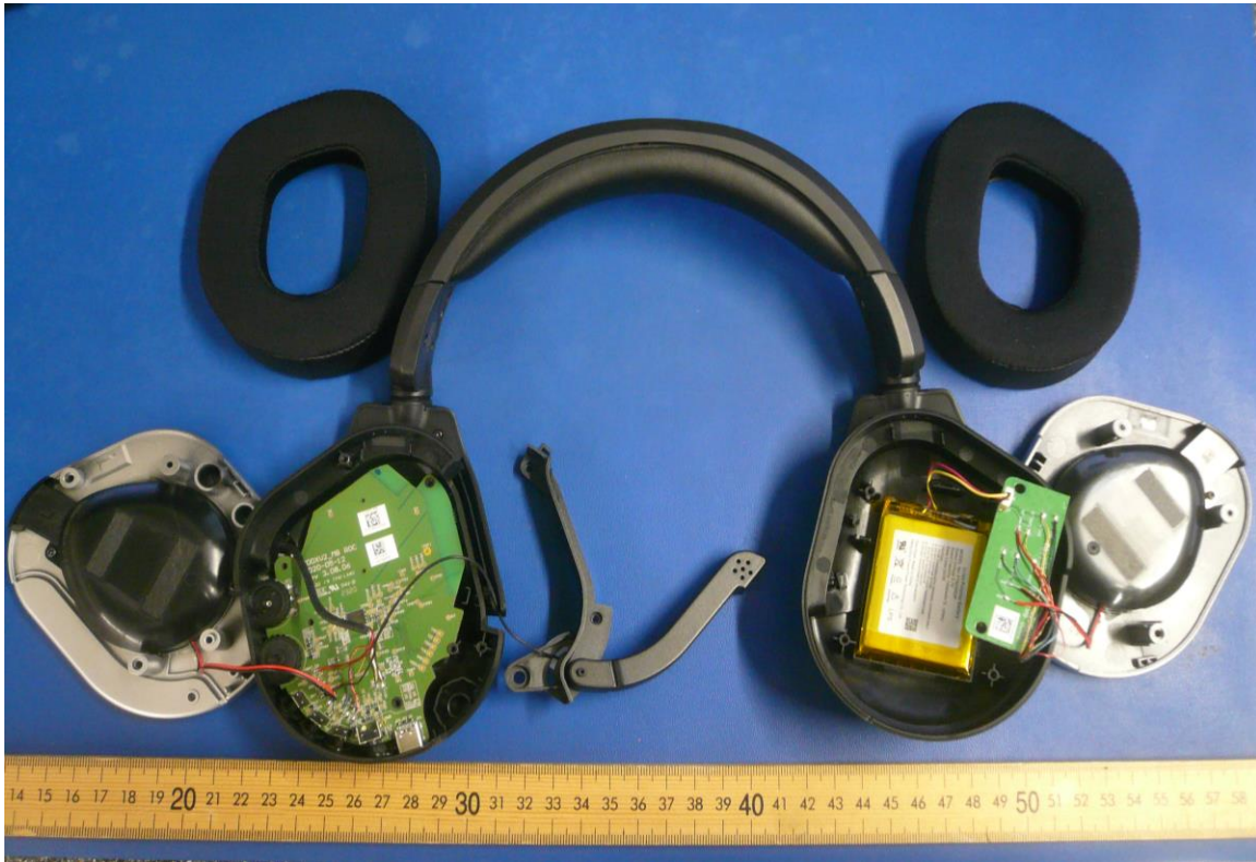
Figure 2: Internal Photo of Stealth 700X Gen 2 - Remove Speakers