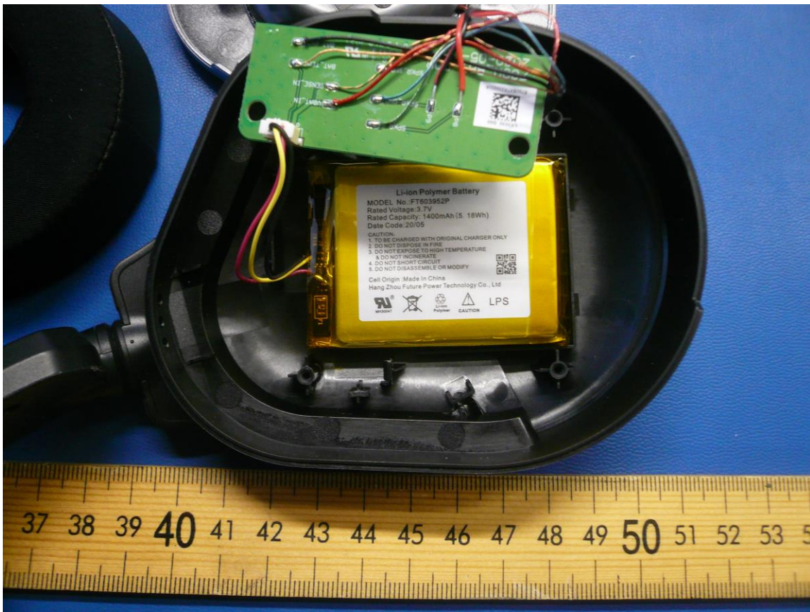
Figure 5: Internal Photo of Stealth 700X Gen 2 (Right Ear PCB and Battery)