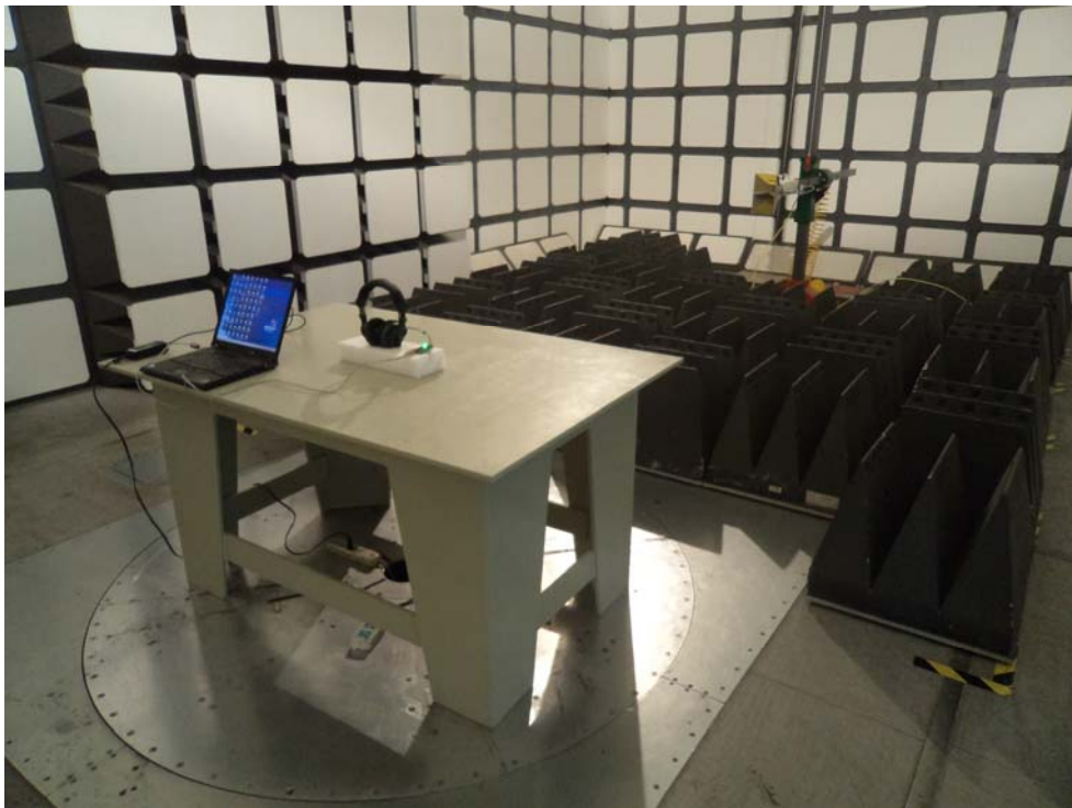
Radiated Emissions – Rear View