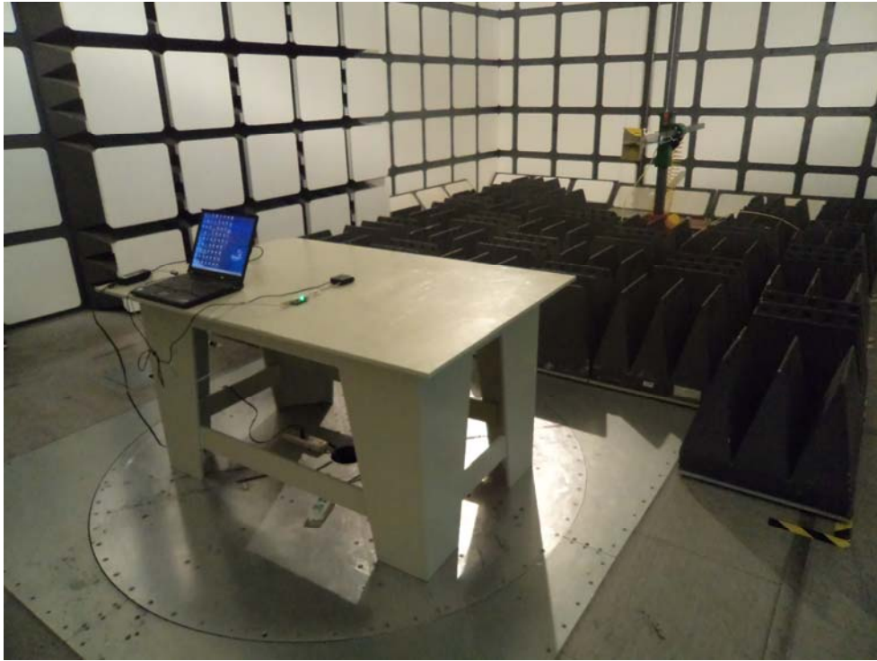
Radiated Emissions – Rear View