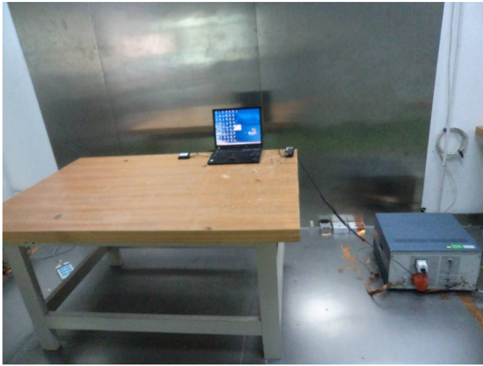
Conducted Emissions –Side View