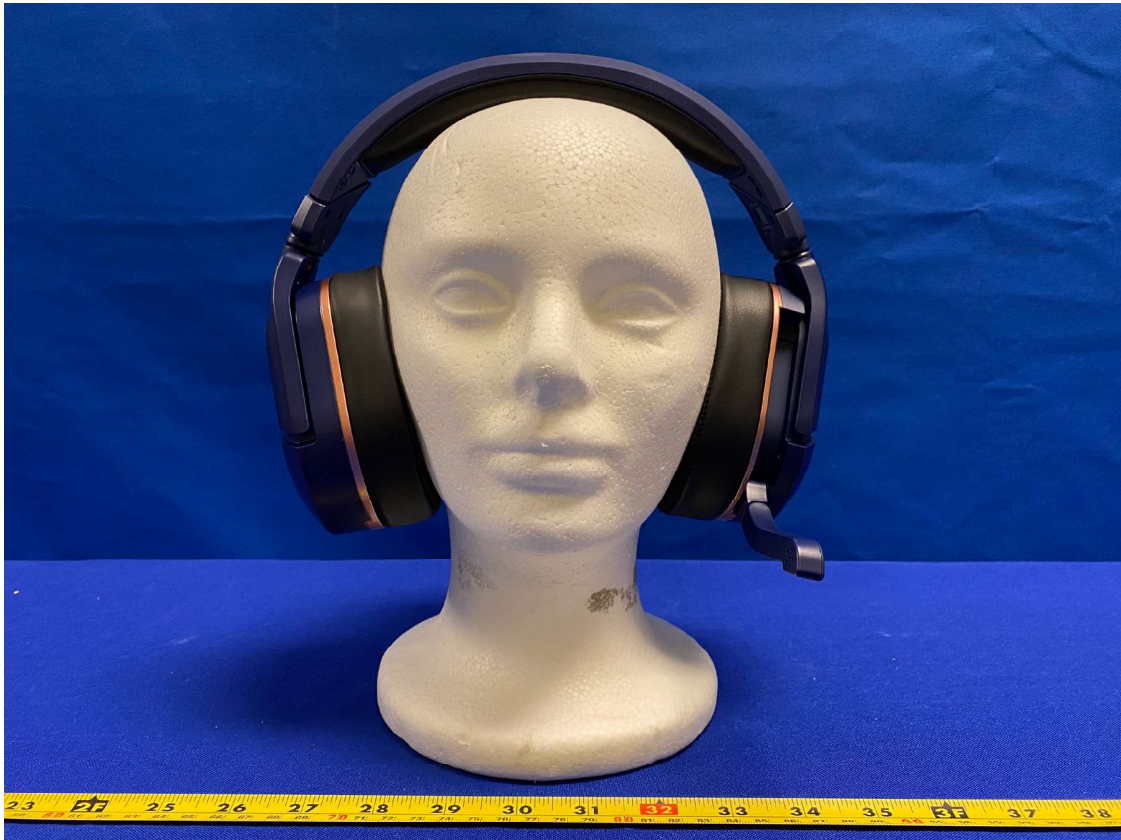
Figure 8: External Photo of Stealth700X-MAX-RX (Midnight Blue version) - Front