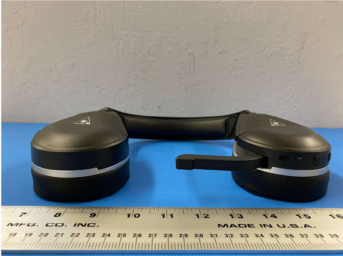
Figure 6: External Photo of Stealth700X-MAX-RX (Black version) - Bottom