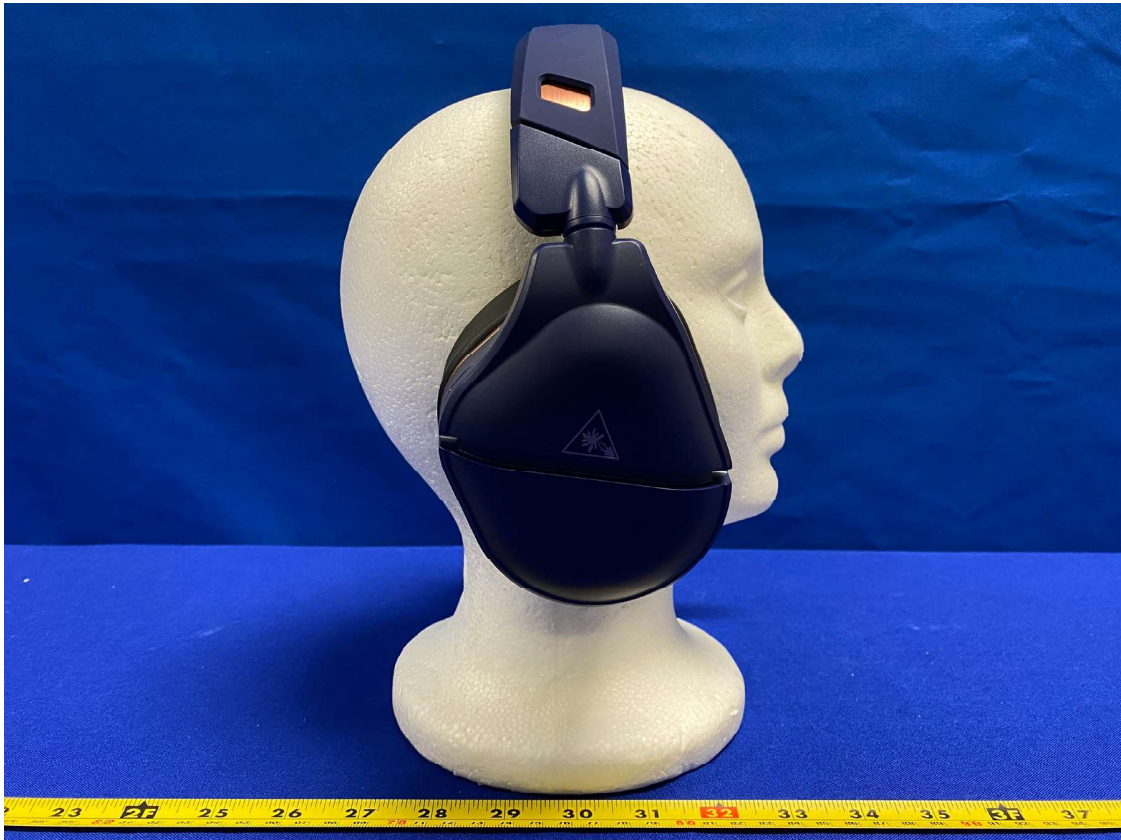
Figure 11: External Photo of Stealth700X-MAX-RX (Midnight Blue version) – Right