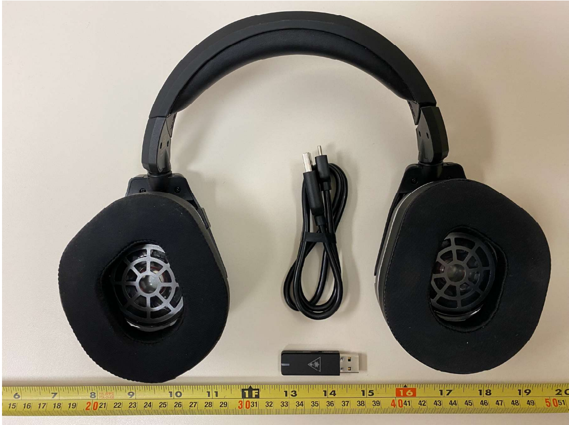
Figure 7: External Photo of Stealth700X-MAX-RX with Stealth700X-MAX-TX (Black version) – Inner Ear Cups