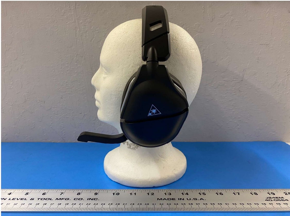
Figure 2: External Photo of Stealth700X-MAX-RX (Black version) - Left