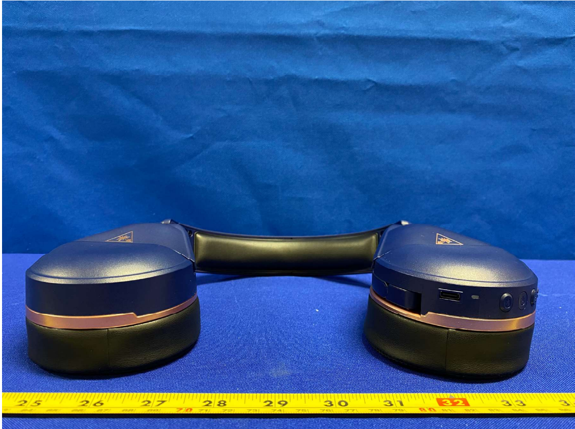
Figure 13: External Photo of Stealth700X-MAX-RX (Midnight Blue version) - Bottom