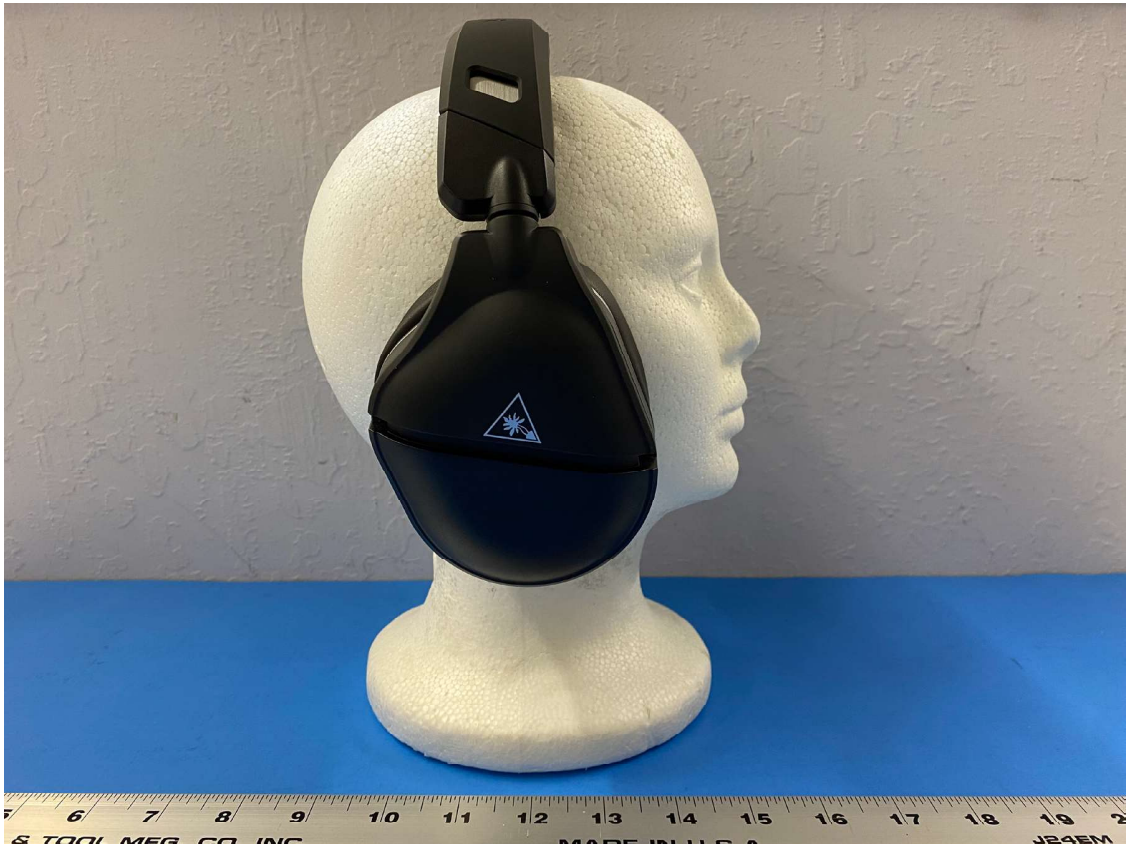
Figure 4: External Photo of Stealth700X-MAX-RX (Black version) – Right