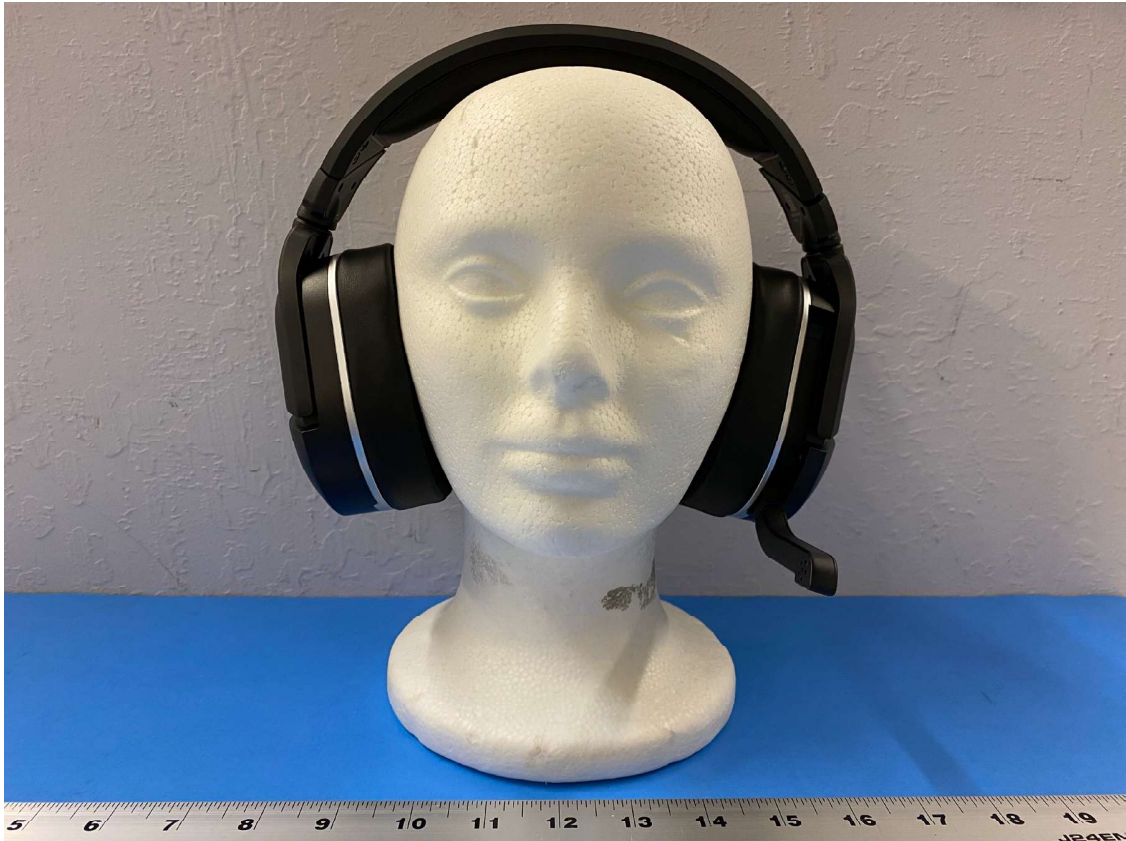
Figure 1: External Photo of Stealth700X-MAX-RX (Black version) - Front