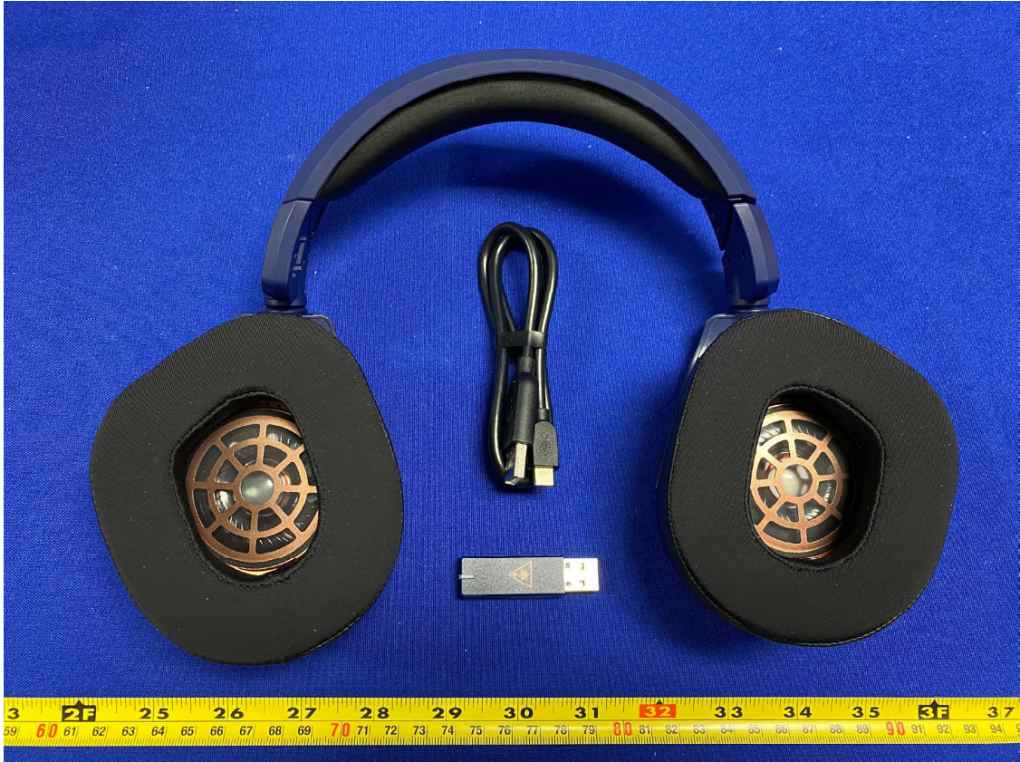
Figure 14: External Photo of Stealth700X-MAX-RX with Stealth700X-MAX-TX (Midnight Blue version) – Inner Ear Cups