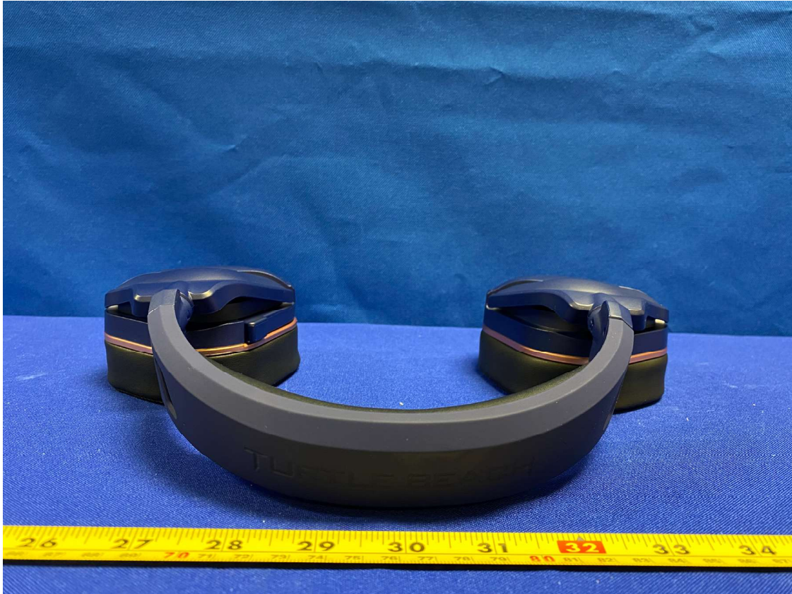
Figure 12: External Photo of Stealth700X-MAX-RX (Midnight Blue version) – Top