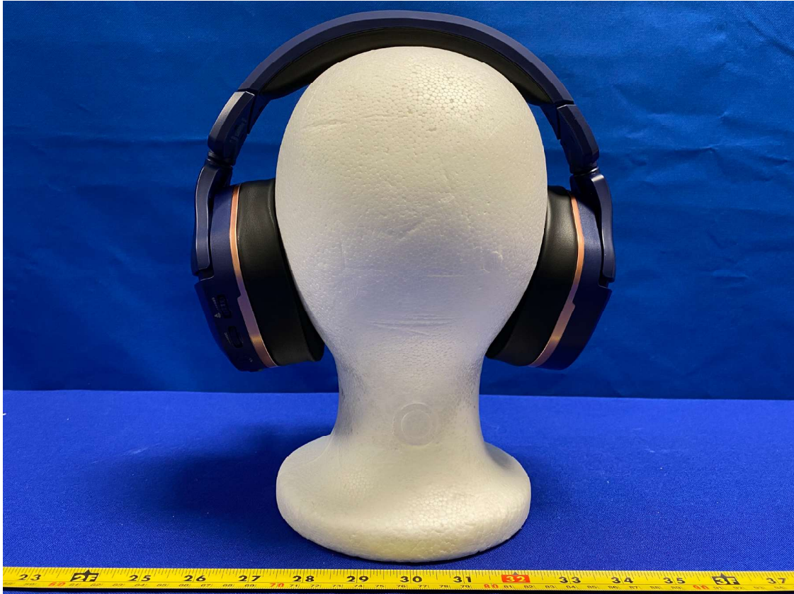
Figure 10: External Photo of Stealth700X-MAX-RX (Midnight Blue version) - Rear