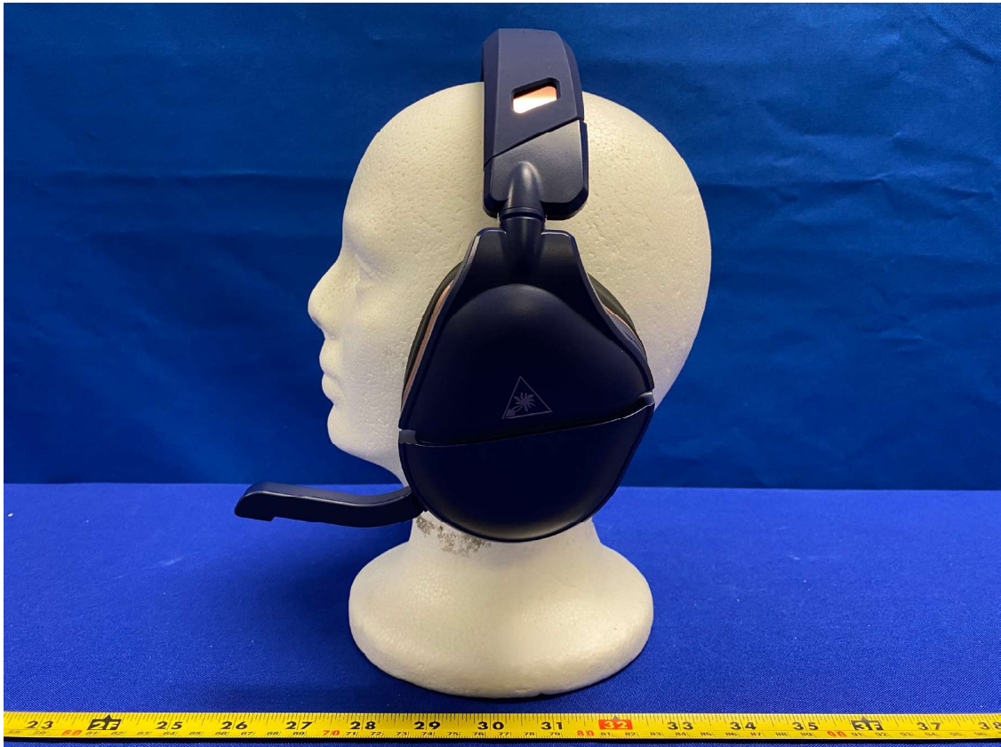
Figure 9: External Photo of Stealth700X-MAX-RX (Midnight Blue version) - Left