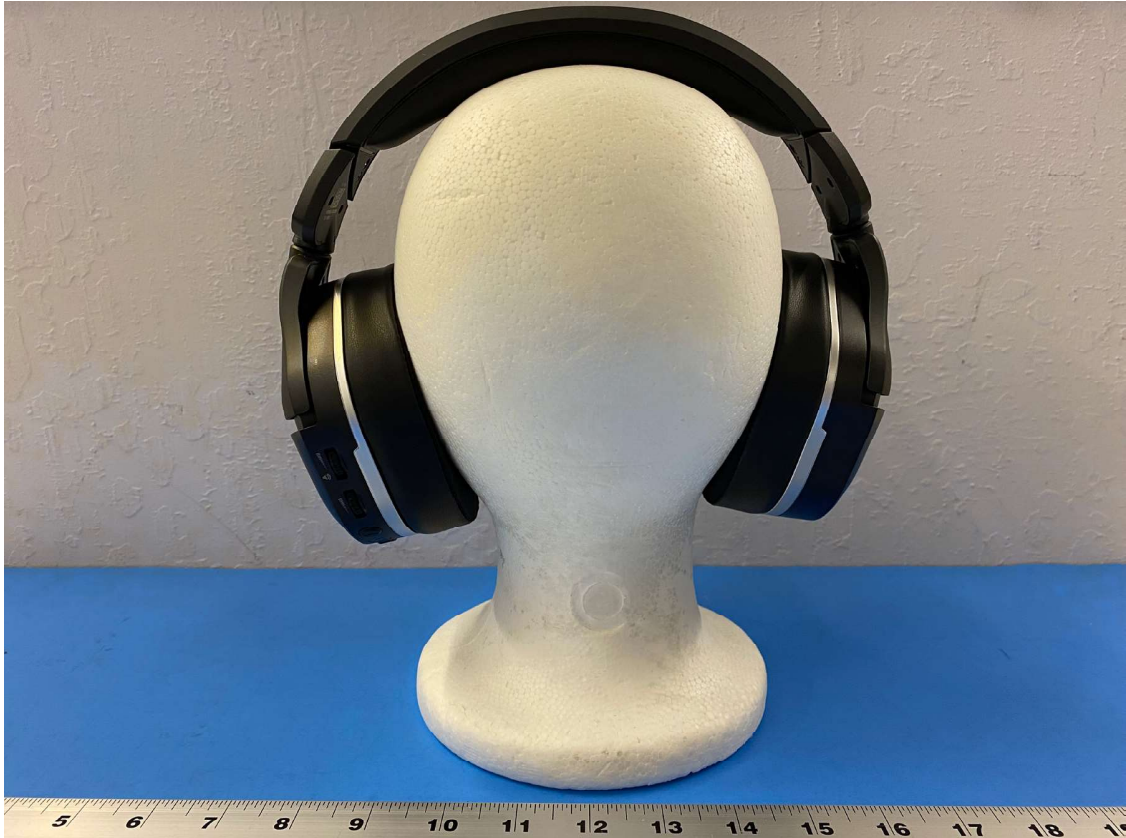
Figure 3: External Photo of Stealth700X-MAX-RX (Black version) - Rear