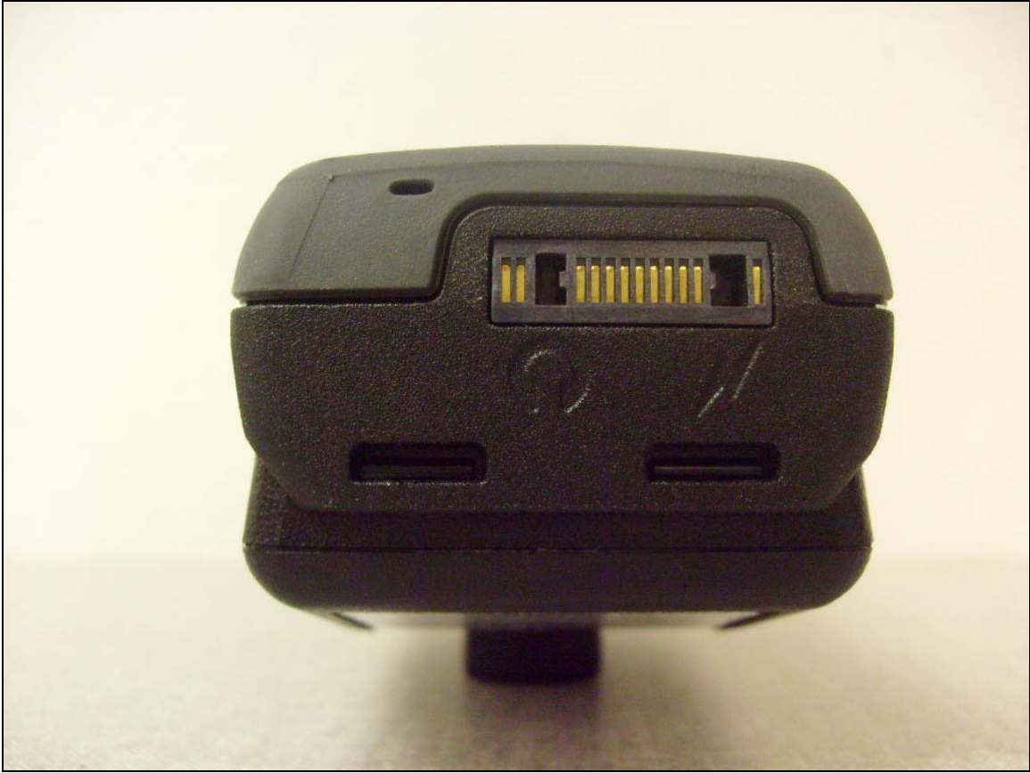
Photograph 2. Bottom View