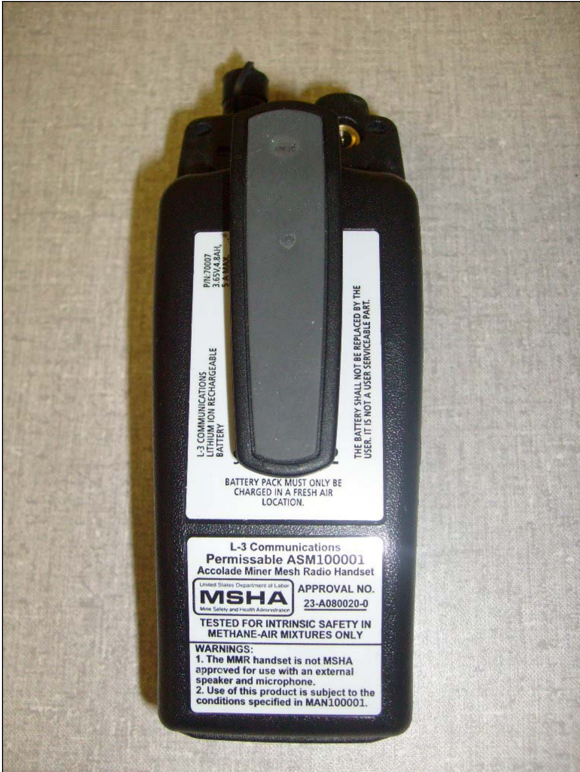
Photograph 1. Back View