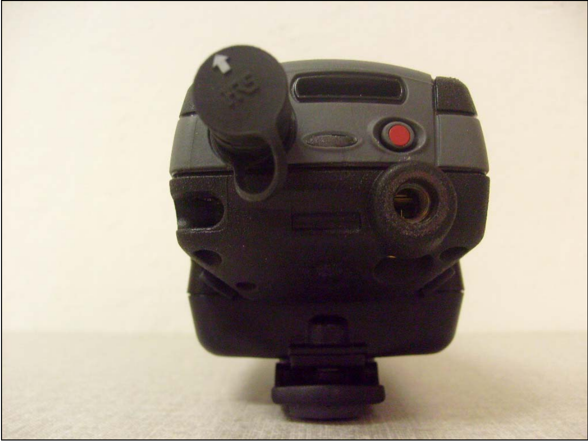
Photograph 6. Top View