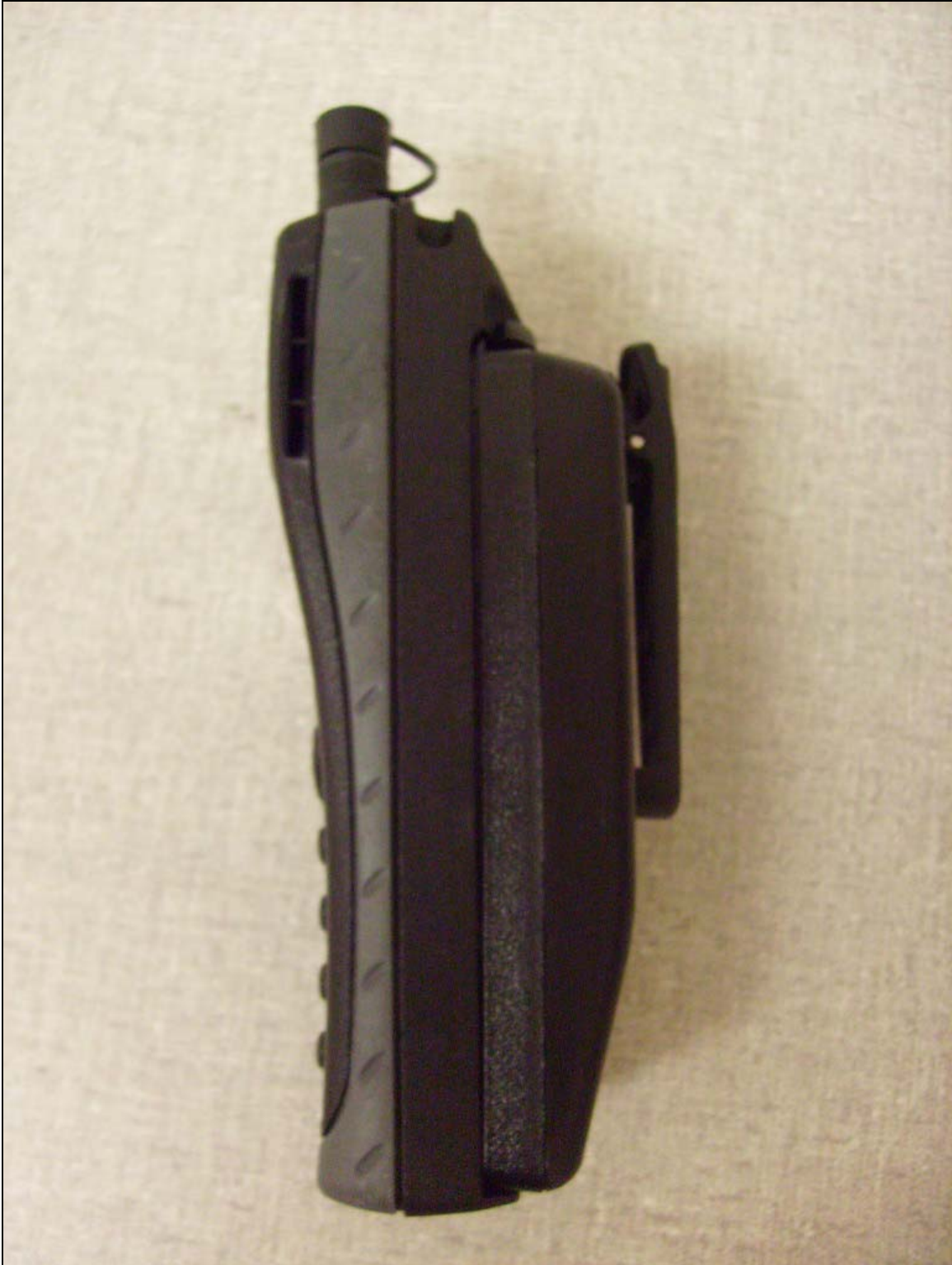
Photograph 5. Right View