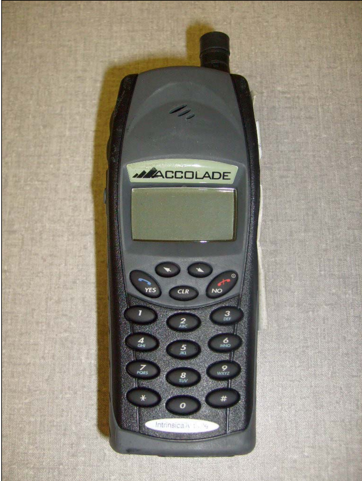
Photograph 3. Front View