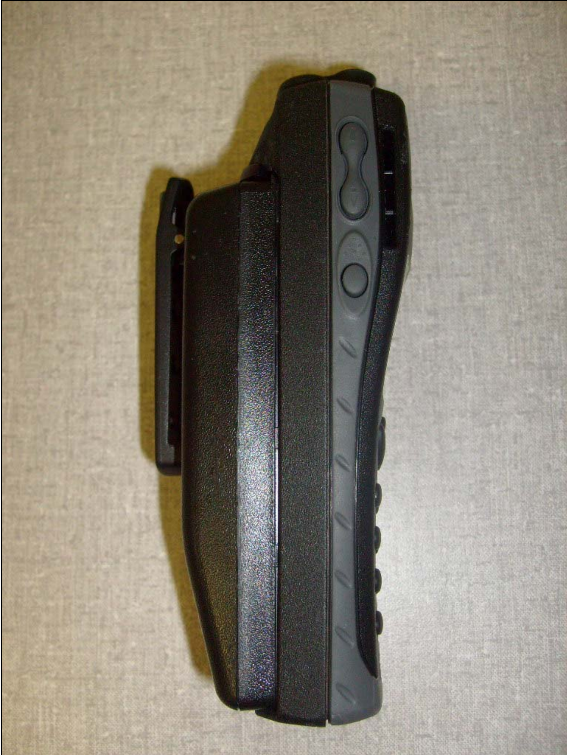
Photograph 4. Left View