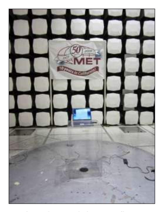
Photograph 4. Radiated Emissions, Test Setup, Front View