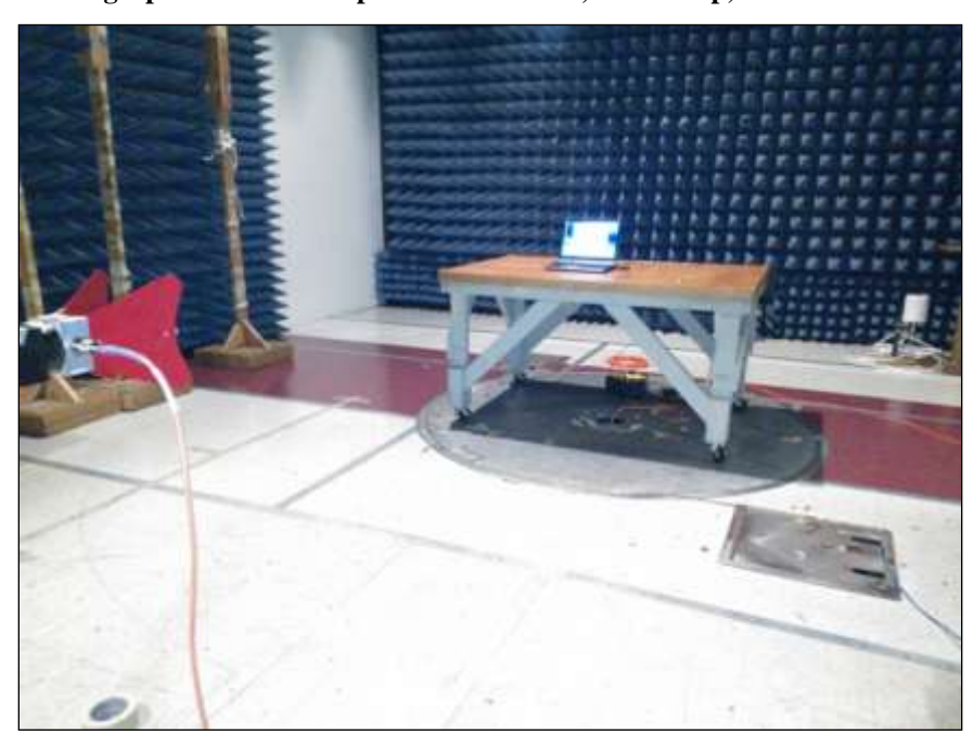
Photograph 8. Radiated Spurious Emissions, Test Setup, 1 GHz – 18 GHz