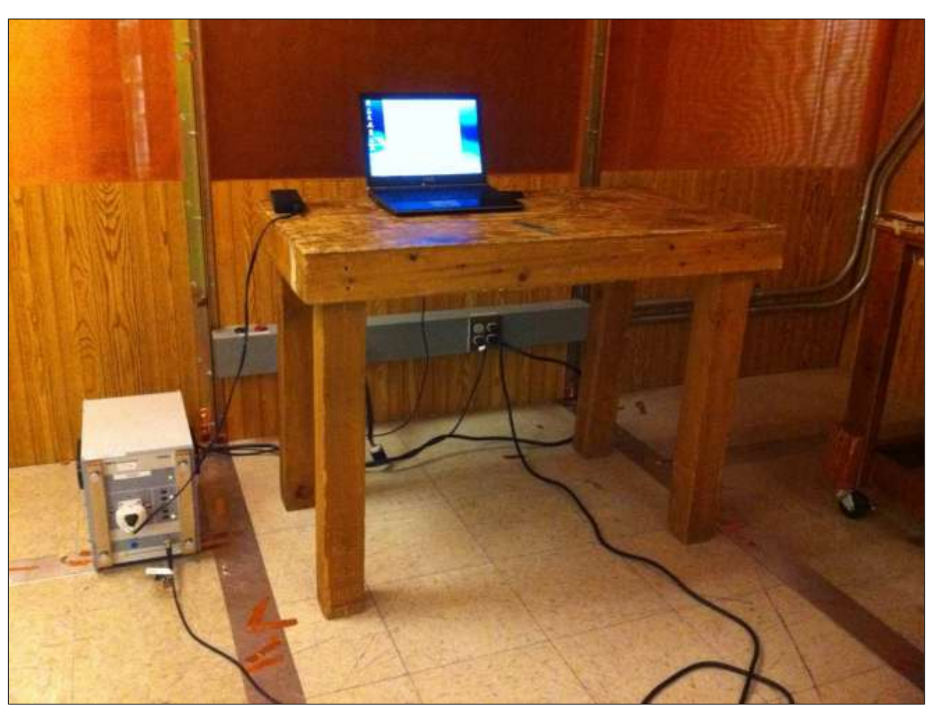
Photograph 6. Conducted Emissions, 15.207(a), Test Setup