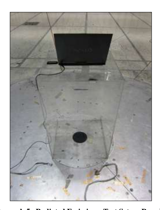
Photograph 5. Radiated Emissions, Test Setup, Rear View