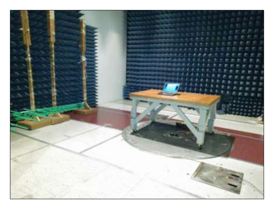
Photograph 7. Radiated Spurious Emissions, Test Setup, 30 \ \text{MHz} - 1 \ \text{GHz}