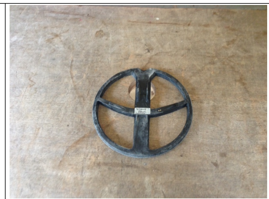
Search coil Ø22