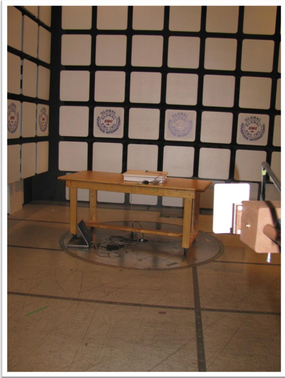
Figure 1 – Radiated emissions