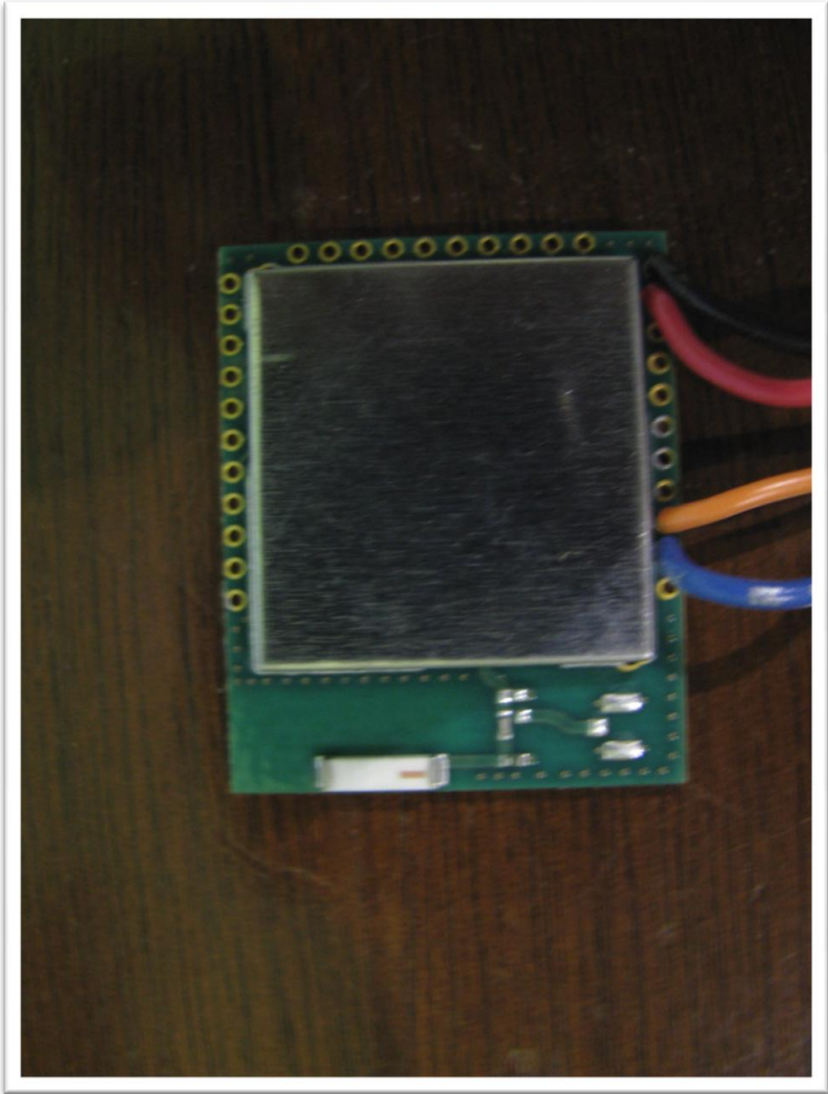
Figure 1 – EUT with Ceramic ship antenna