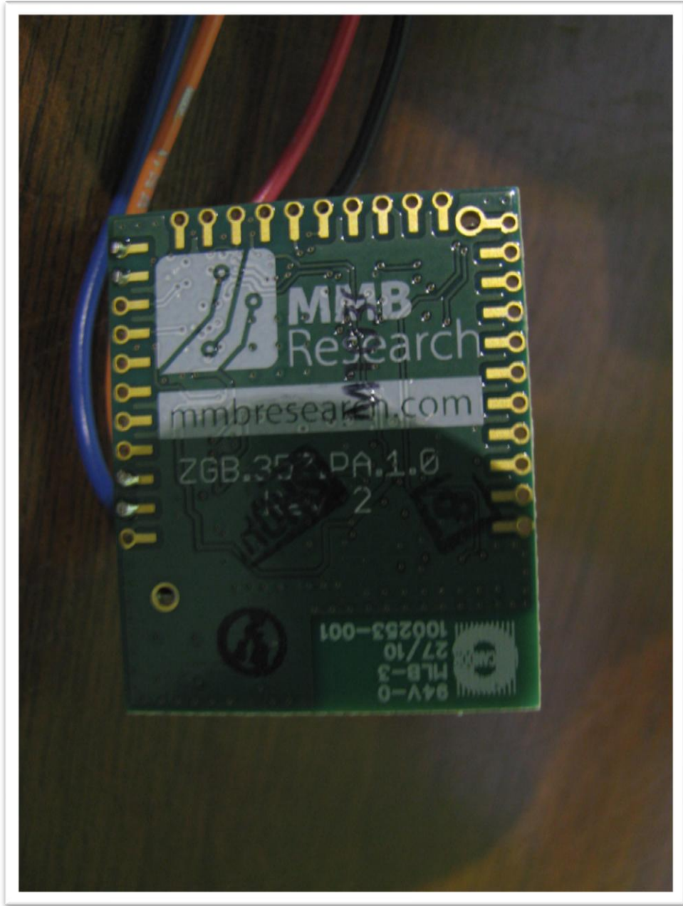
Figure 4 – Rear of EUT