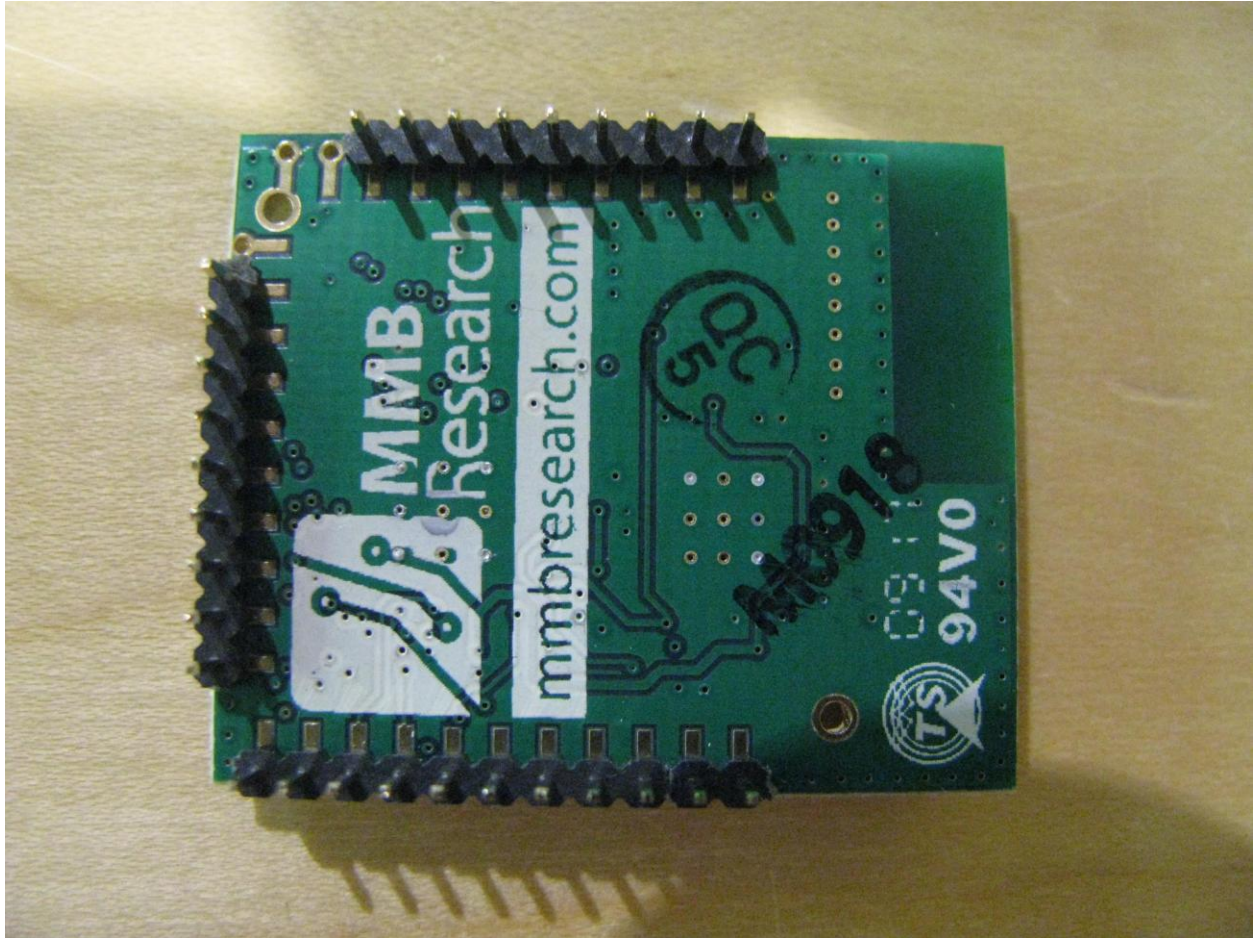
Figure 2 – RF Chip Back