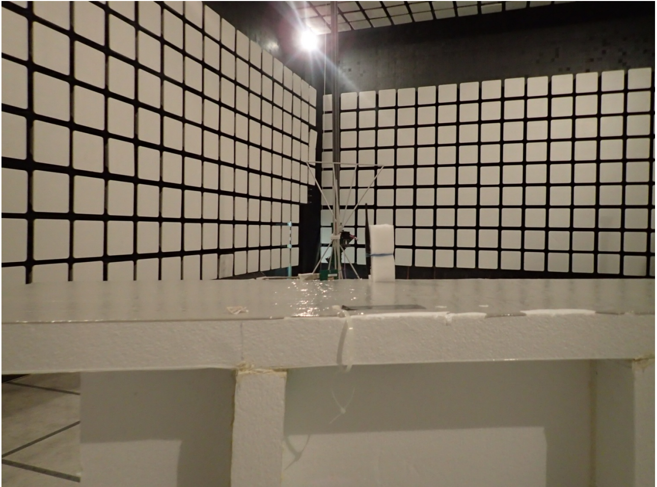
Radiated Emissions @ 3 m, Orthogonal Position 2