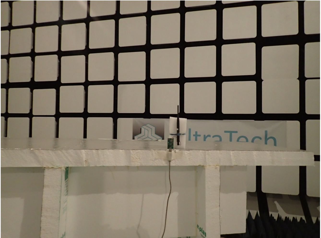
Radiated Emissions @ 3 m, Orthogonal Position 3