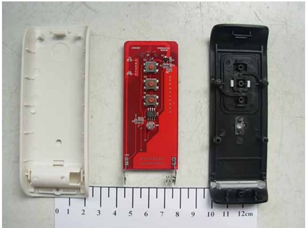
FIGURE 1 EMITTER (M/N: WSRE SERIES) COVER REMOVED