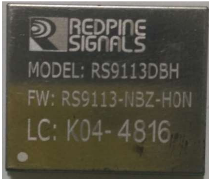
EUT Top View