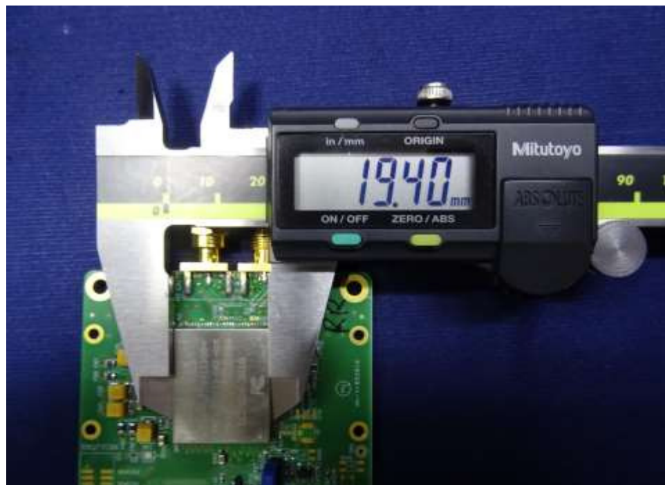
EUT Dimensional view