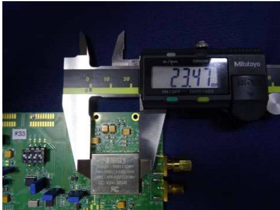
EUT Dimensional View