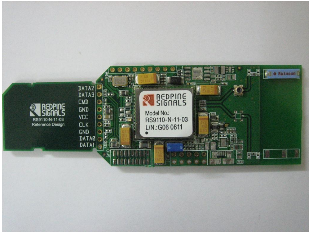
EUT Top View