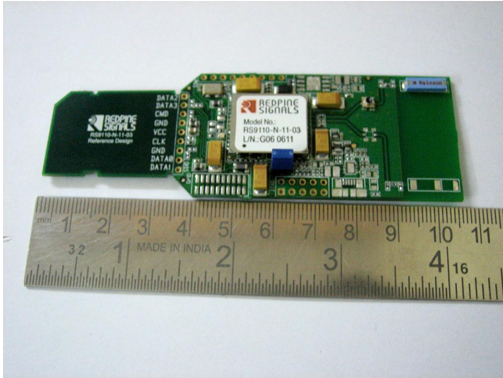
EUT Dimensional View