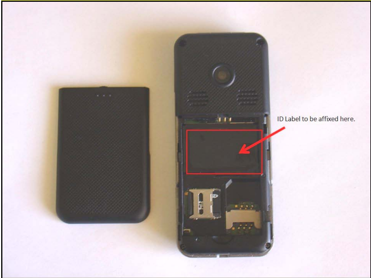
Photograph 2: ID Label Location