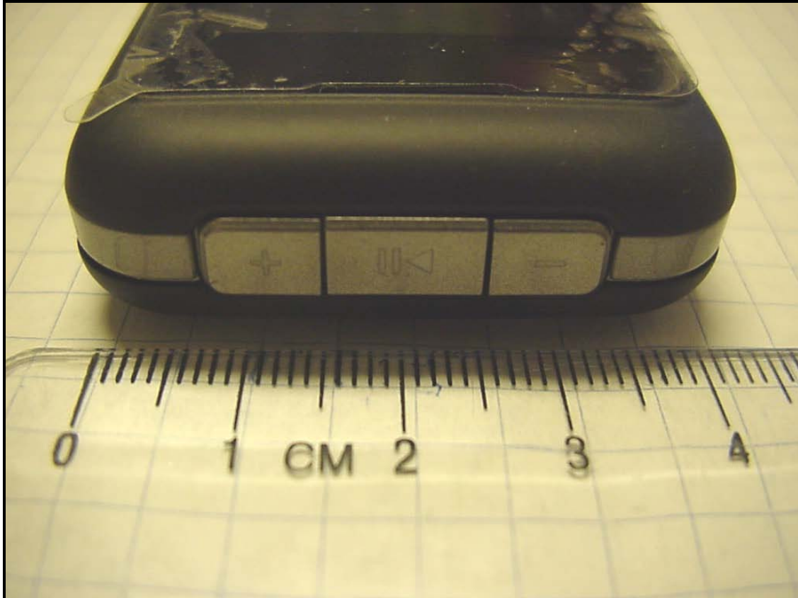
Photograph 6: Top