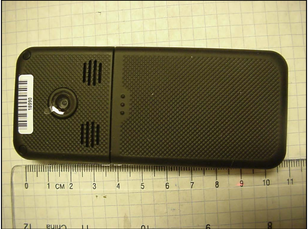
Photograph 5: Back