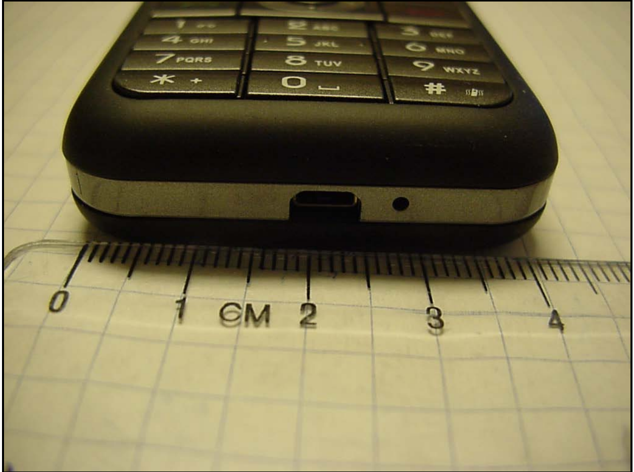
Photograph 7: Bottom