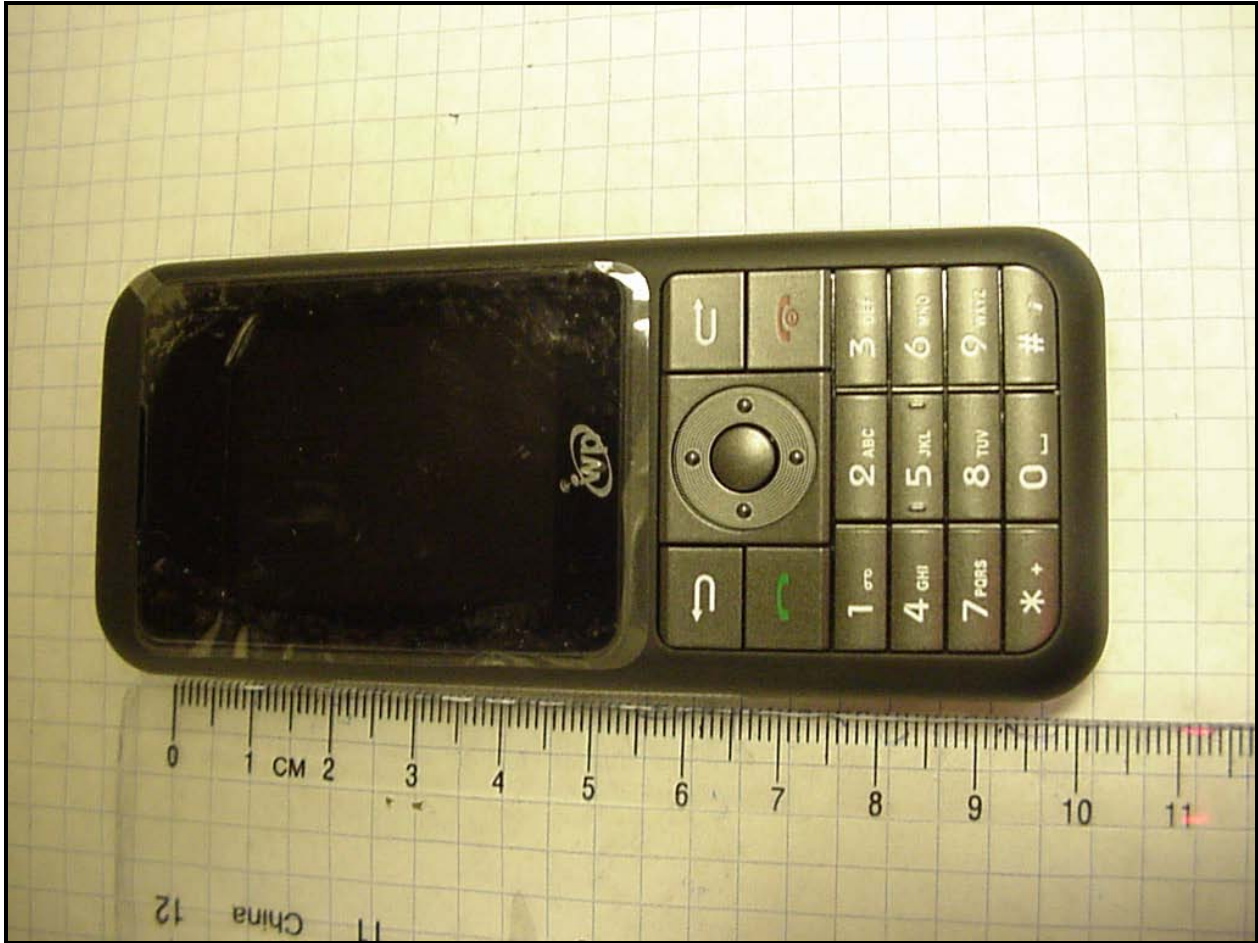
Photograph 4: Front