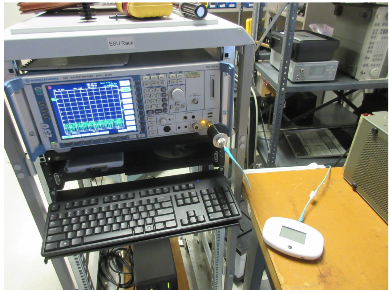
Power Output/Occupied Bandwidth/Bandedge