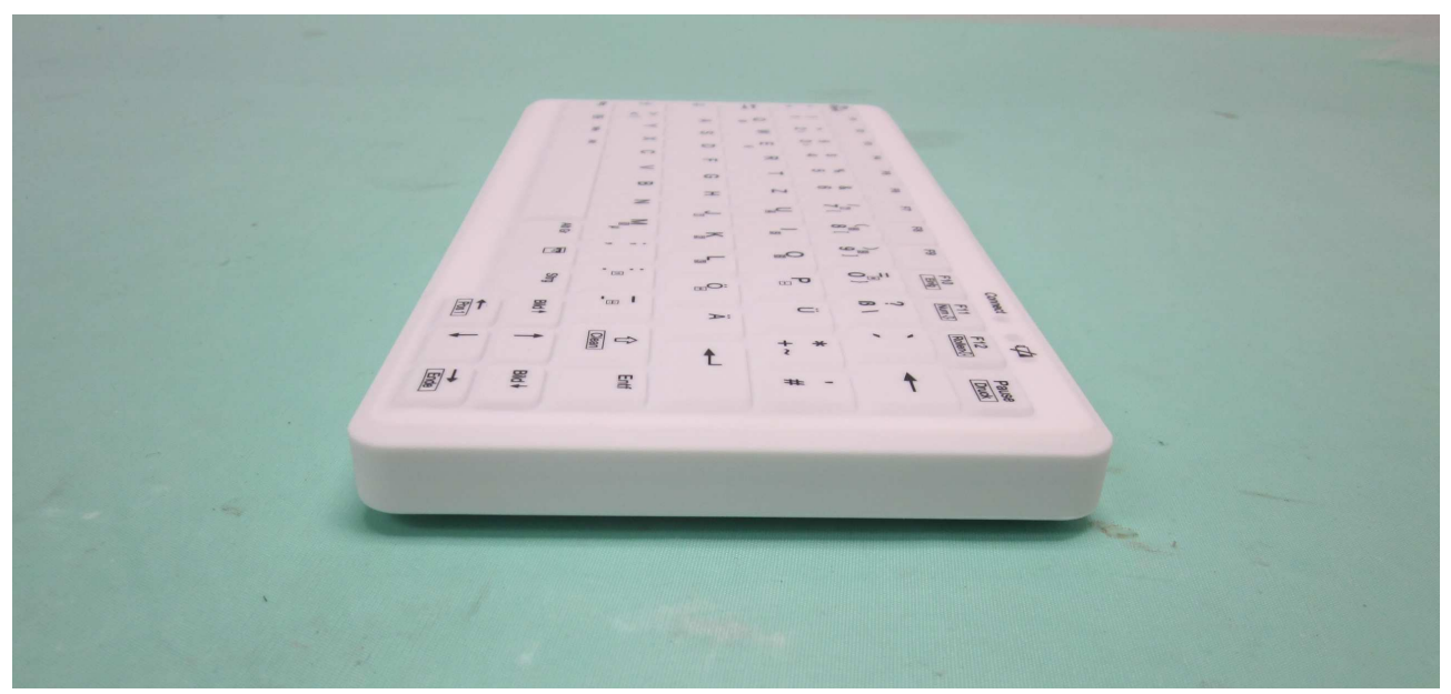
RIGHT VIEW OF THE PRODUCT