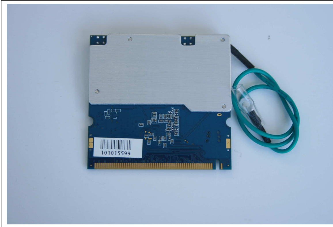
Back of Module With Heat Sink – Non Removable

Internal Pictures of the WLM200N5-26ESD FCC ID: XEC-SP5300-01