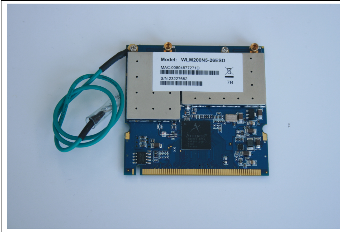
Front of Module with RF shields in place