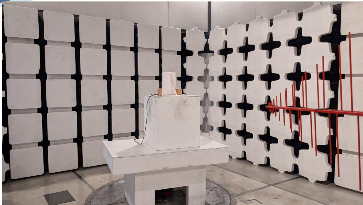
Transmitter Spurious Emissions 30MHz to 1GHz