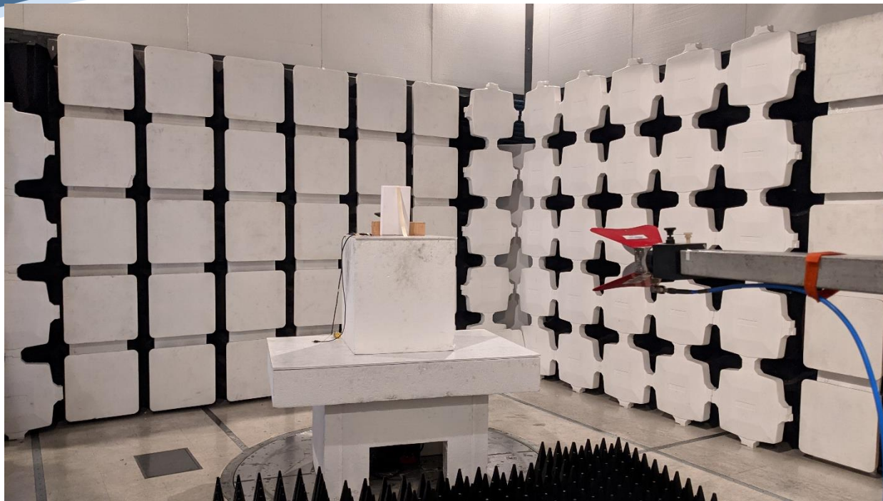
Transmitter Spurious Emissions 1GHz to 18GHz