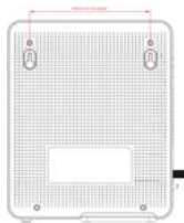
The Distance of the Pothook (Horizontal)