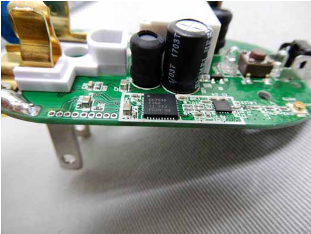
Internal View of EUT-4