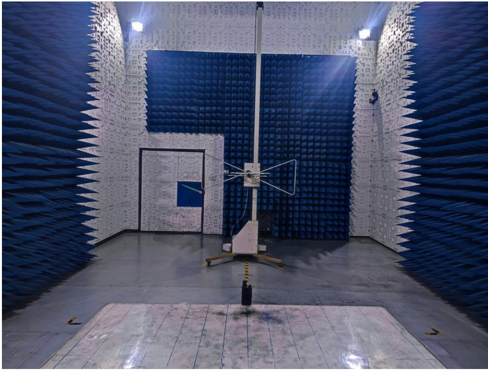
RADIATED EMISSION TEST SETUP ABOVE 1GHz