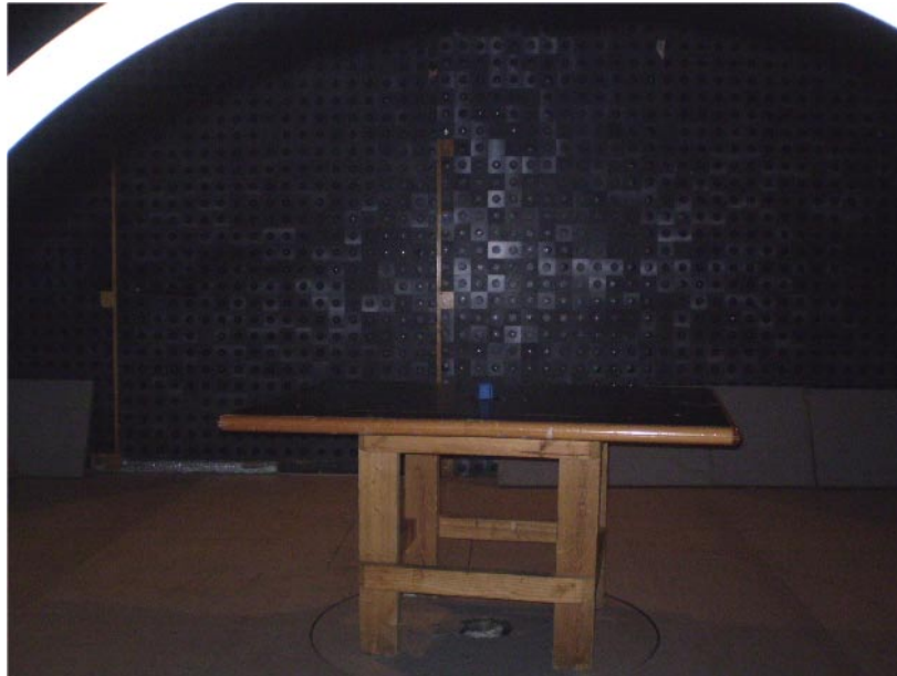
Photograph No.1 Setup for spurious emission measurements in the anechoic chamber below 30 MHz