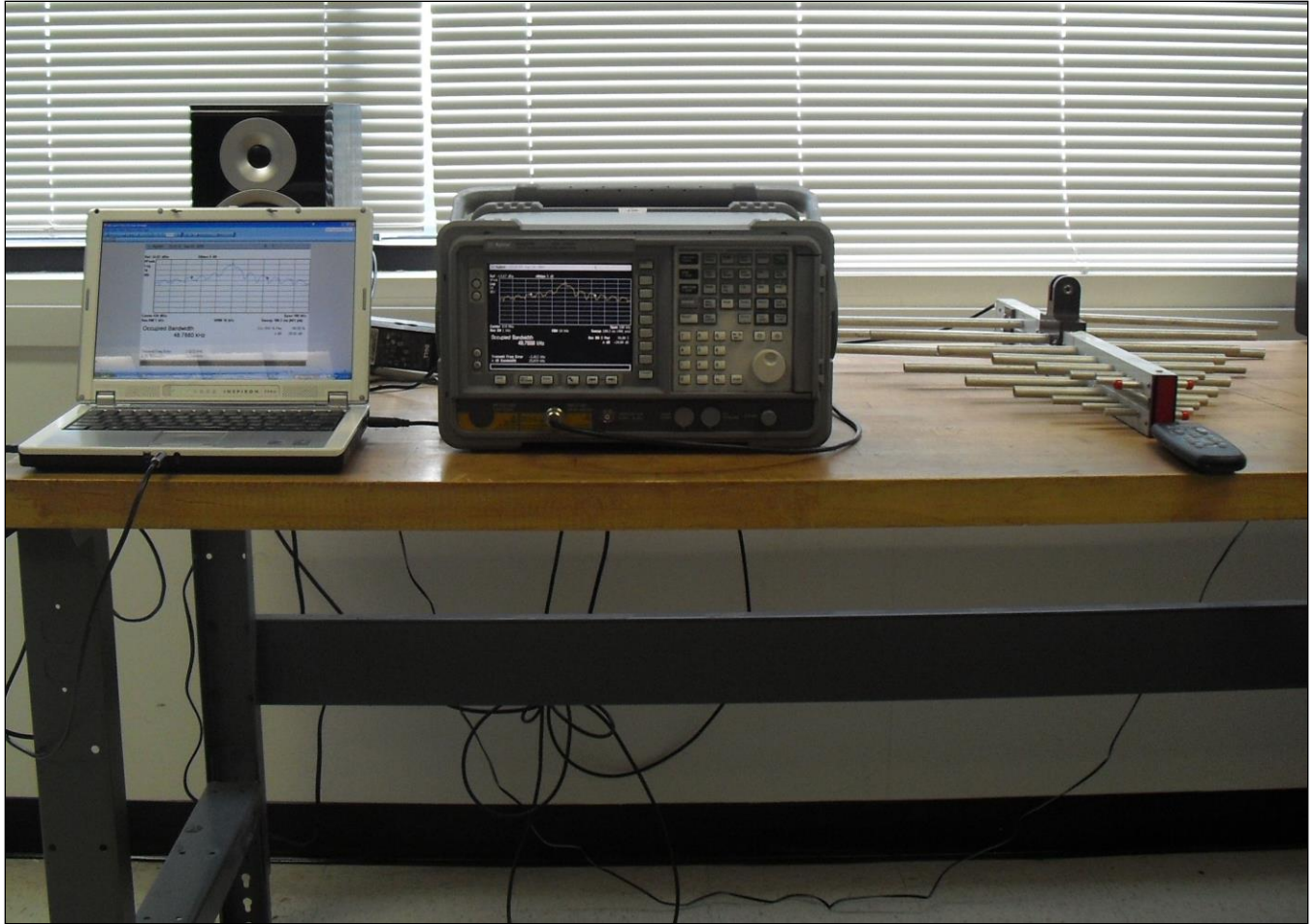
Photograph 4. Bandwidth, Test Setup