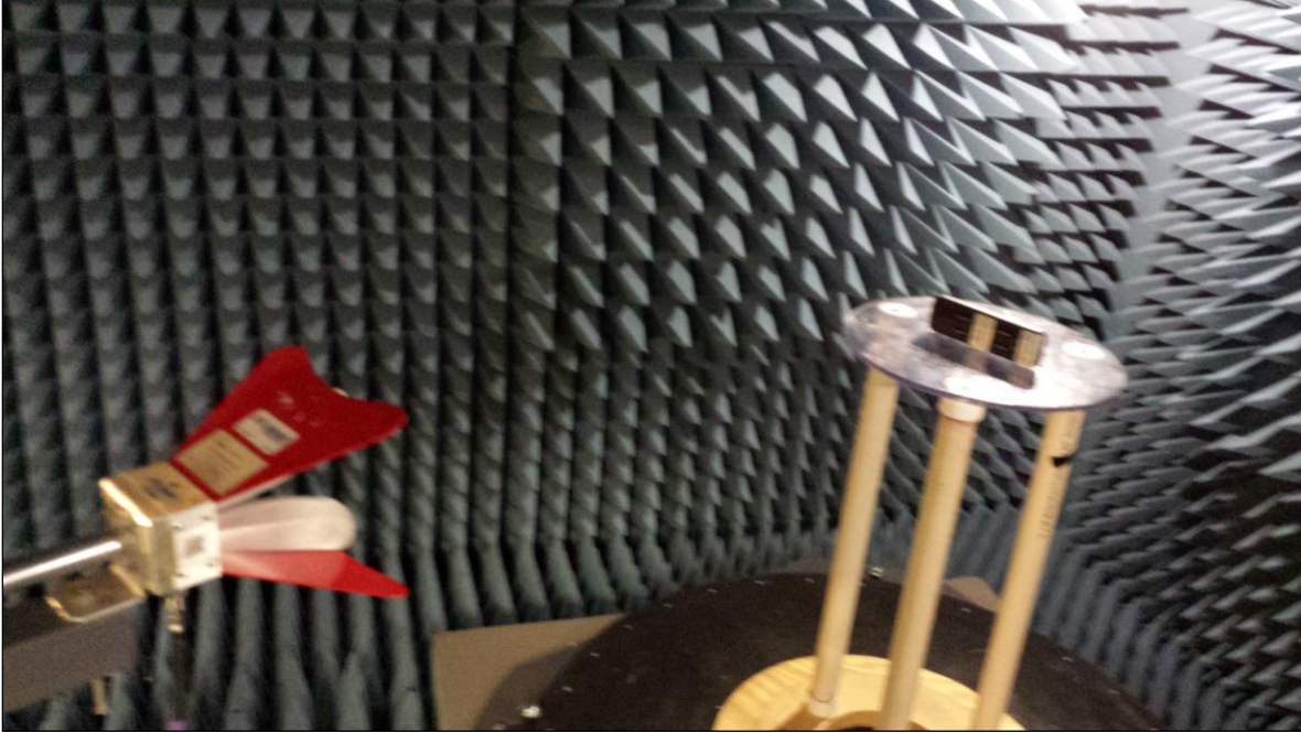
Photograph 3. Field Strength of Fundamental and Harmonics, Test Setup, Above 1 GHz