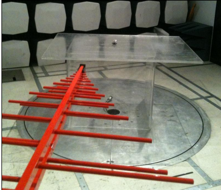
Photograph 2. Field Strength of Fundamental, Test Setup