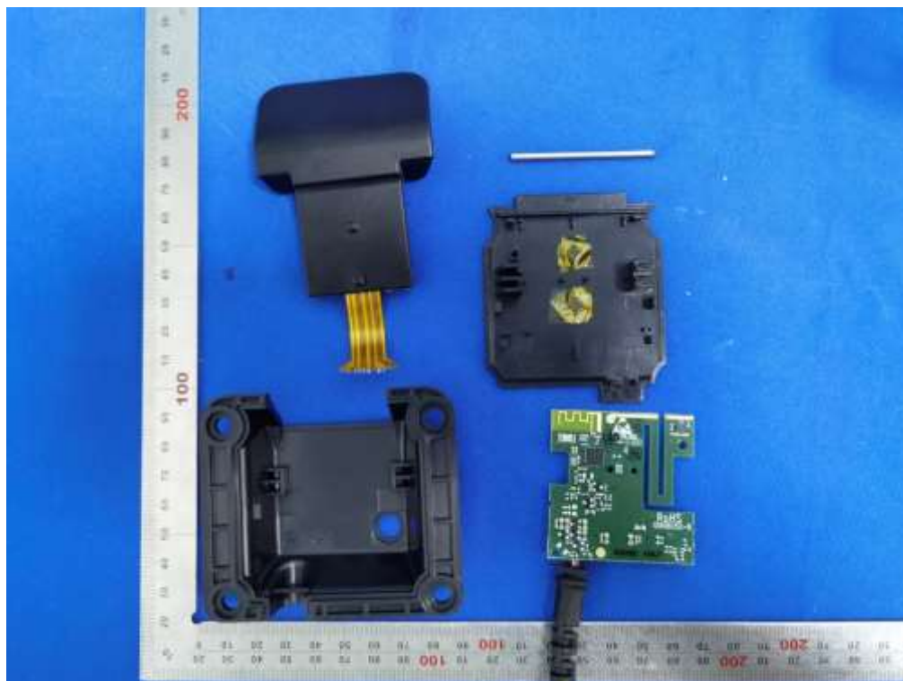
ANTENNA CLOSE-UP PHOTO-1