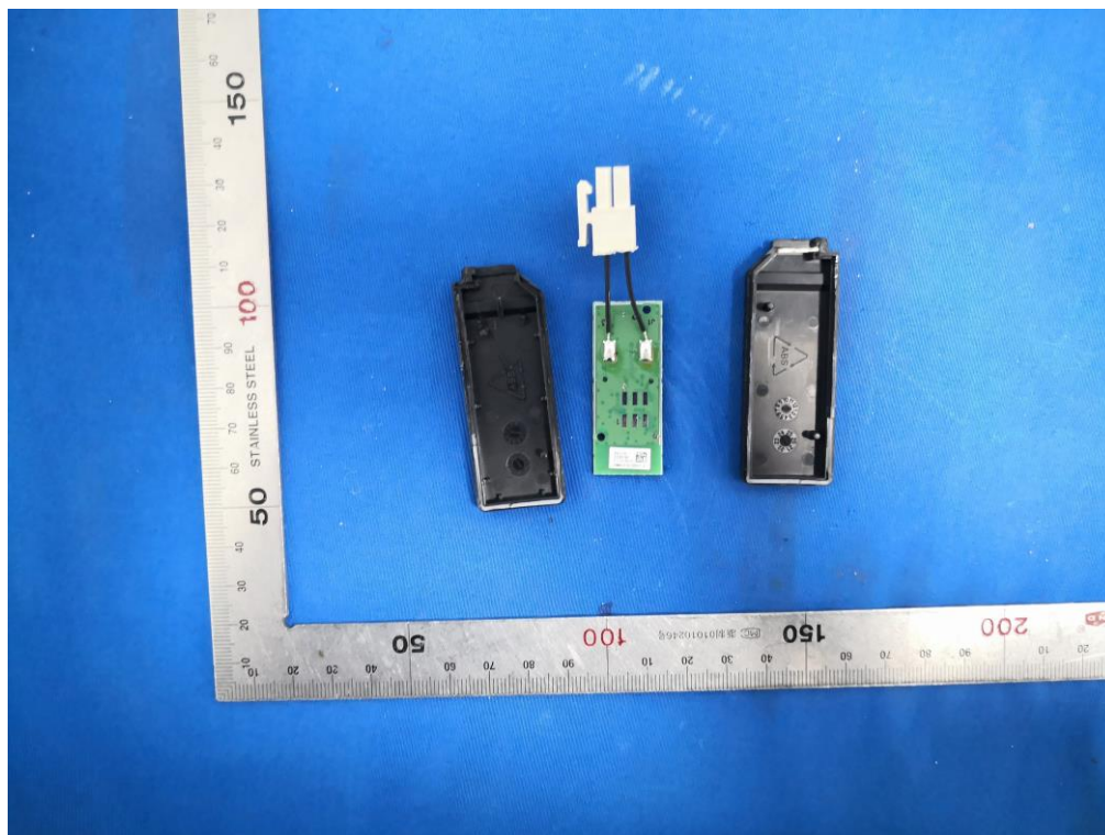
ANTENNA CLOSE-UP PHOTO-1