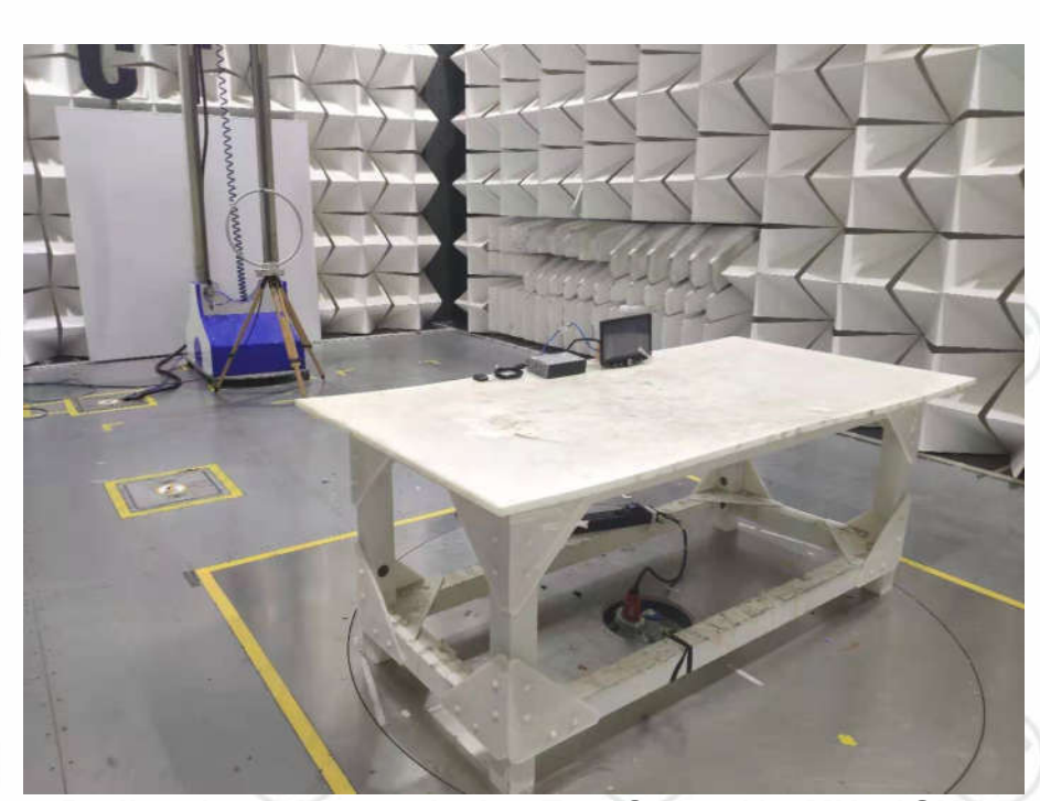
Radiated spurious emission Test Setup-1(30MHz-1GHz)