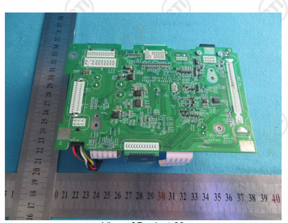
View of Product-22