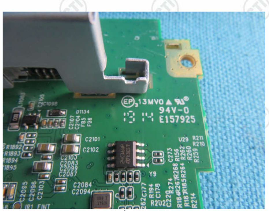
View of Product-16