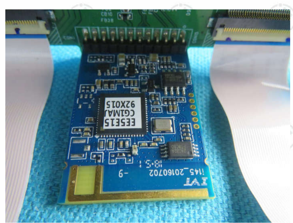
View of Product-21

Report No. : EED32L00178101 Page 53 of 59