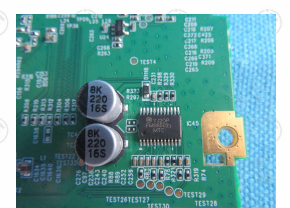
View of Product-15