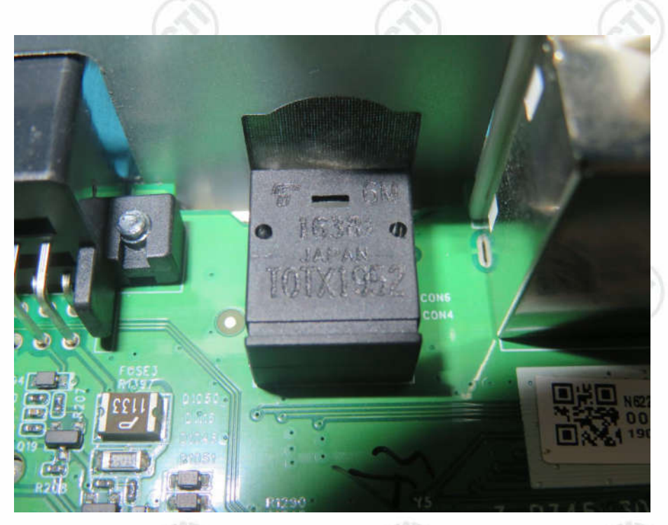
View of Product-24