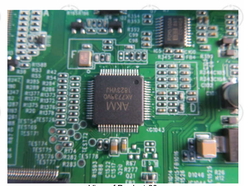
View of Product-20