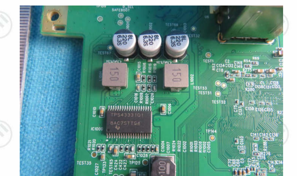
View of Product-13