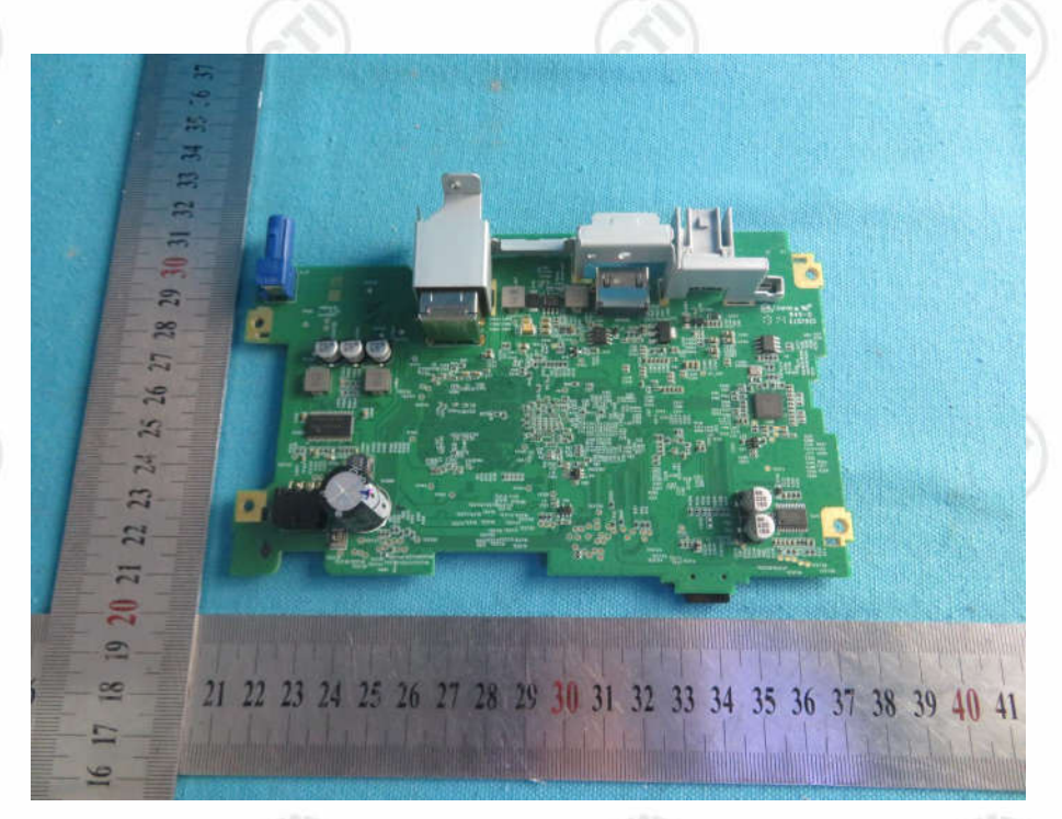
View of Product-12