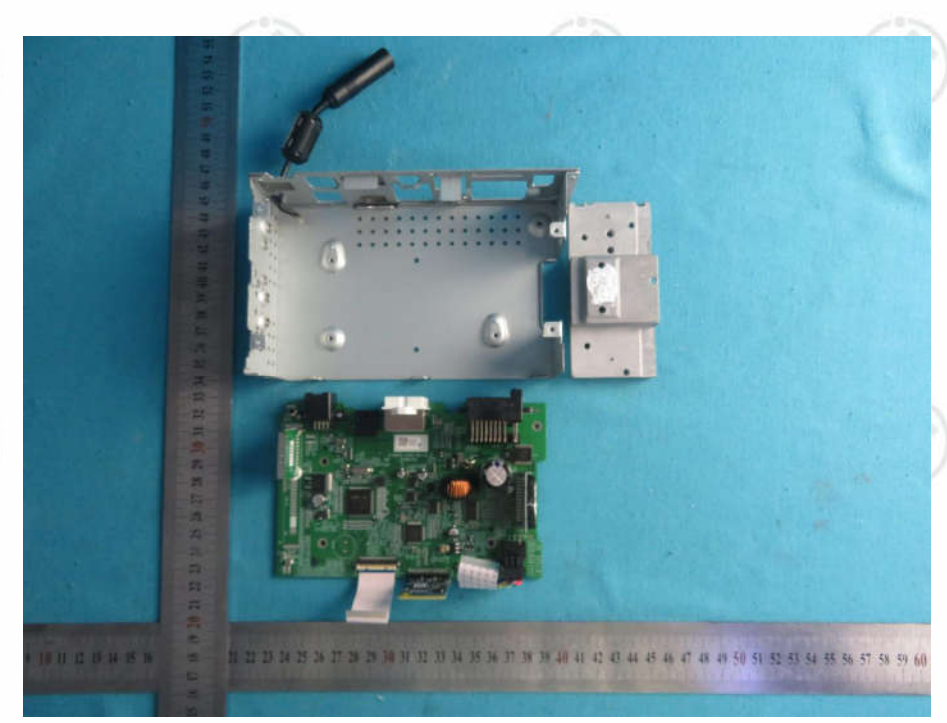
View of Product-17

Report No. : EED32L00178101 Page 51 of 59