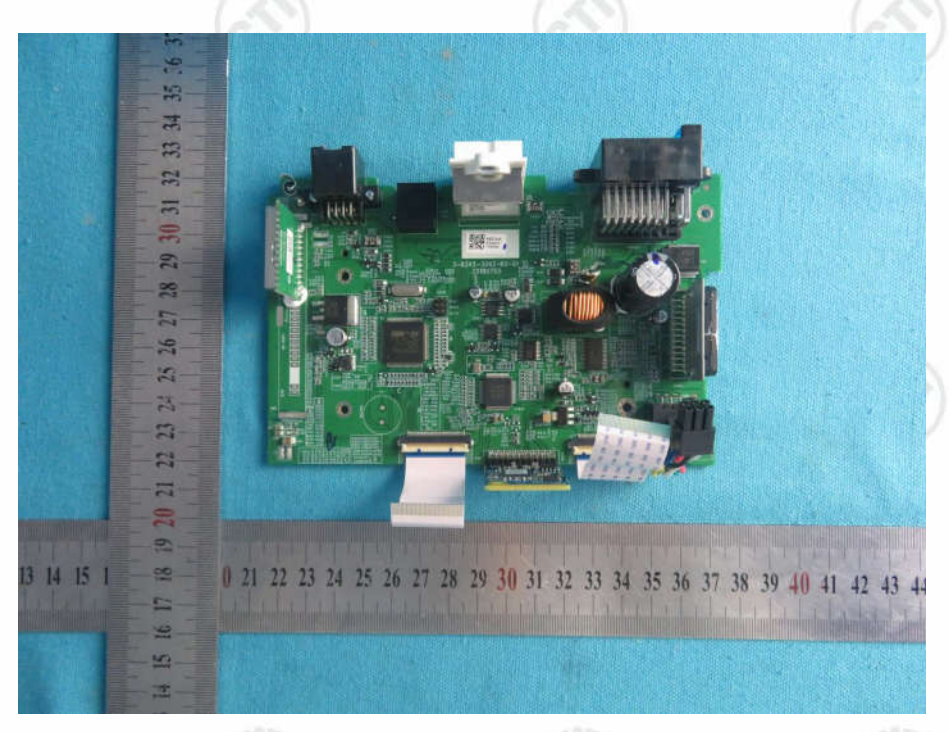
View of Product-18