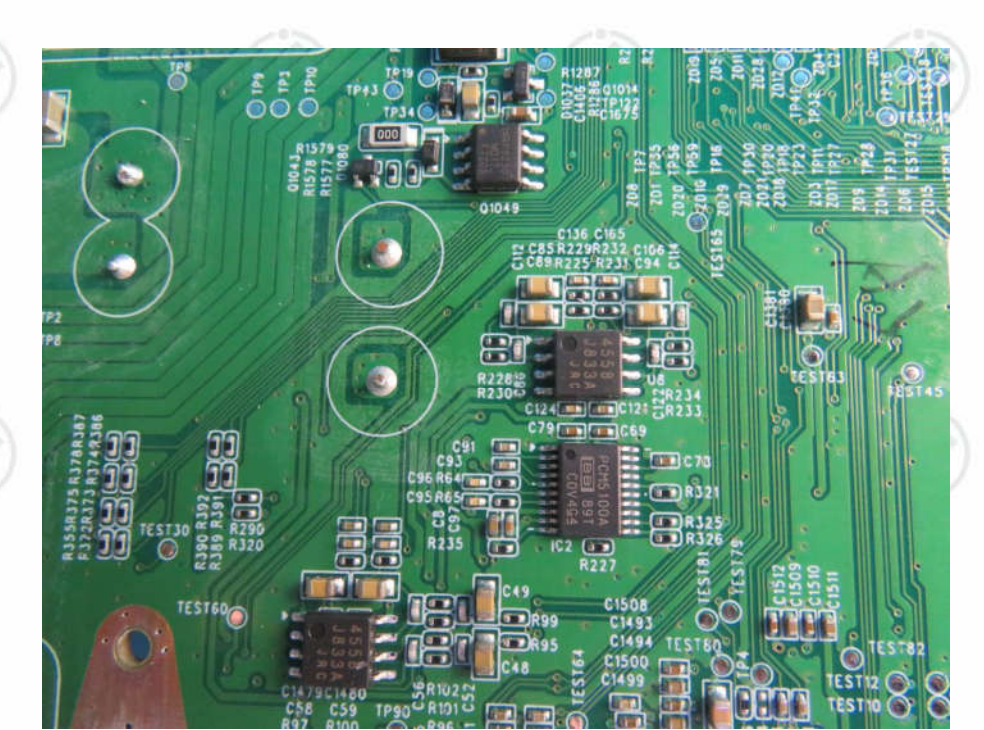
View of Product-23