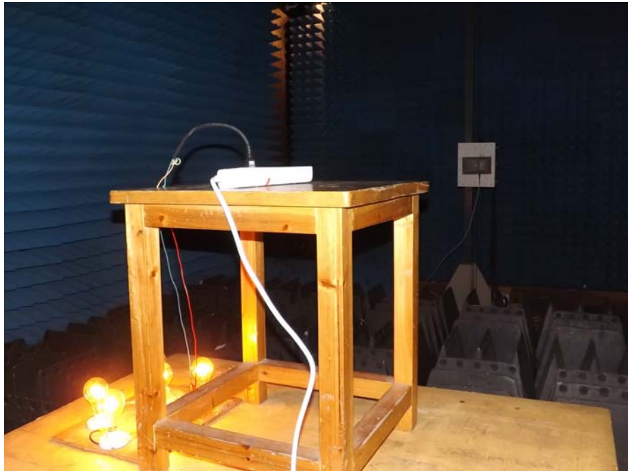
Photograph – Conducted Emission Test Setup at Test Site 1#

Test frequency above 1GHz at test site 1#