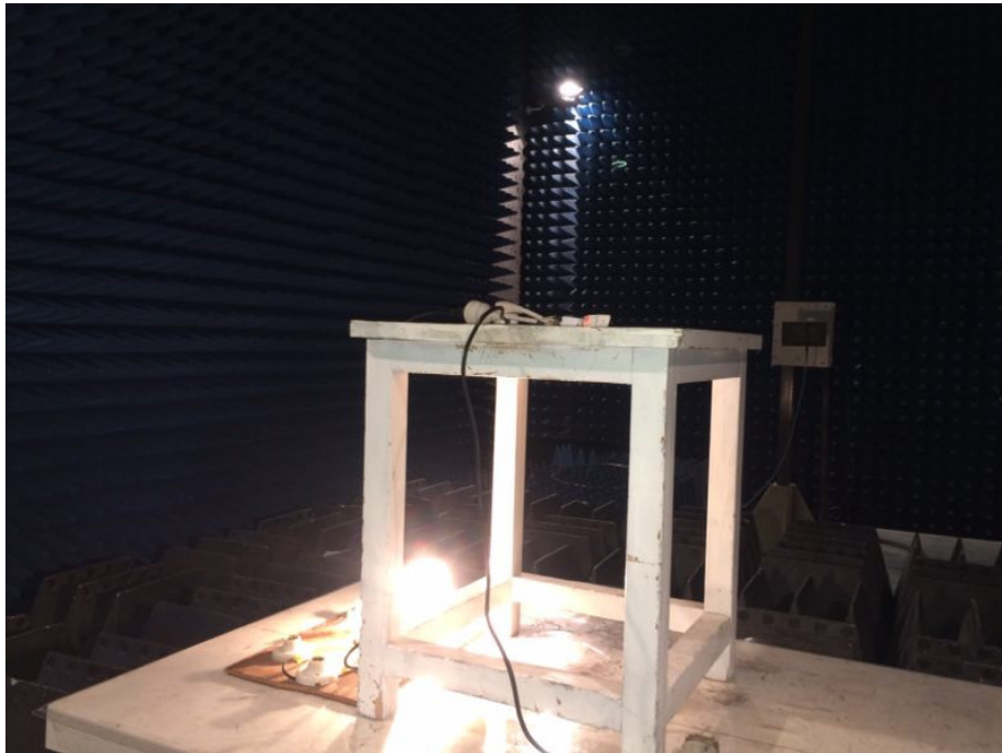
Photograph – Conducted Emission Test Setup at Test Site 2#

Test frequency from 1GHz to 10 GHz at test site 1#