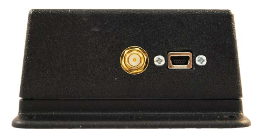
Figure 8.1.1 Mini- USB Port

In order to connect attach the Repeater to a PC via a mini-USB to USB cable. Open WZRDnet Command Center and click on Network in the menu bar. To change Repeater information follow the instructions in the WZRDnet Command Center User Manual