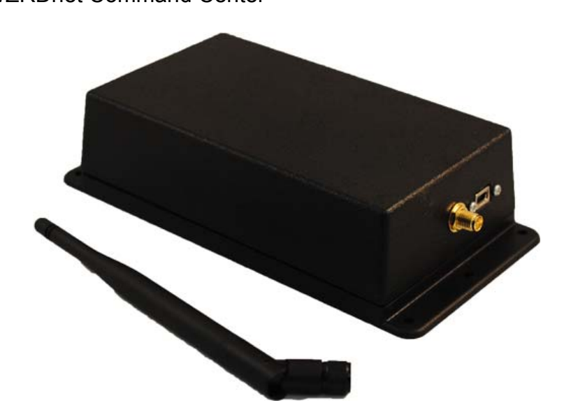
Figure 2.1.1 WRN-320(V)2 Repeater