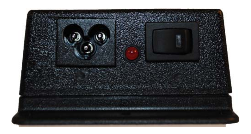
Figure 7.2.1 External Power Connection