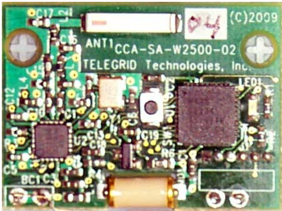
Module PCB Component Side