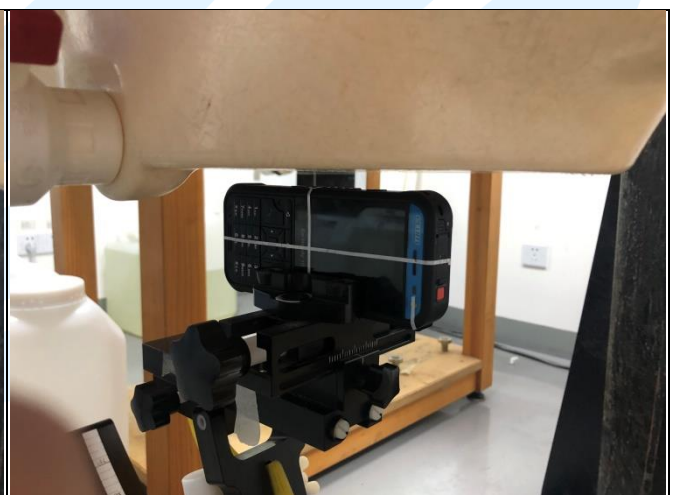
Left Side of EUT with 1.0 cm Gap