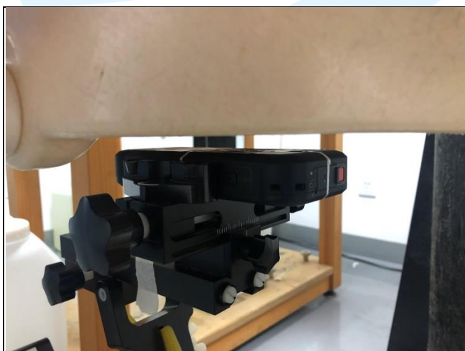
Rear Face of EUT with 1.0 cm Gap