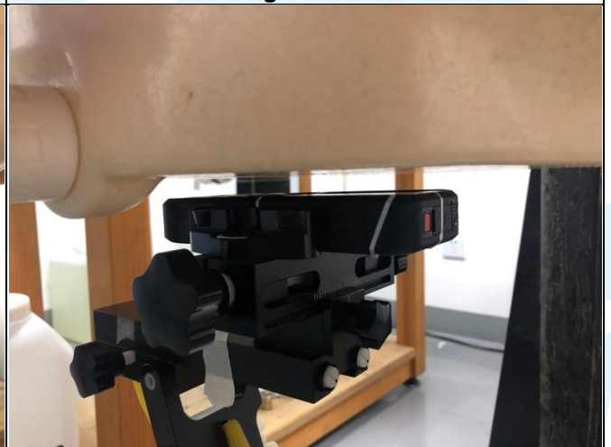
Front Face of EUT with 1.0 cm Gap