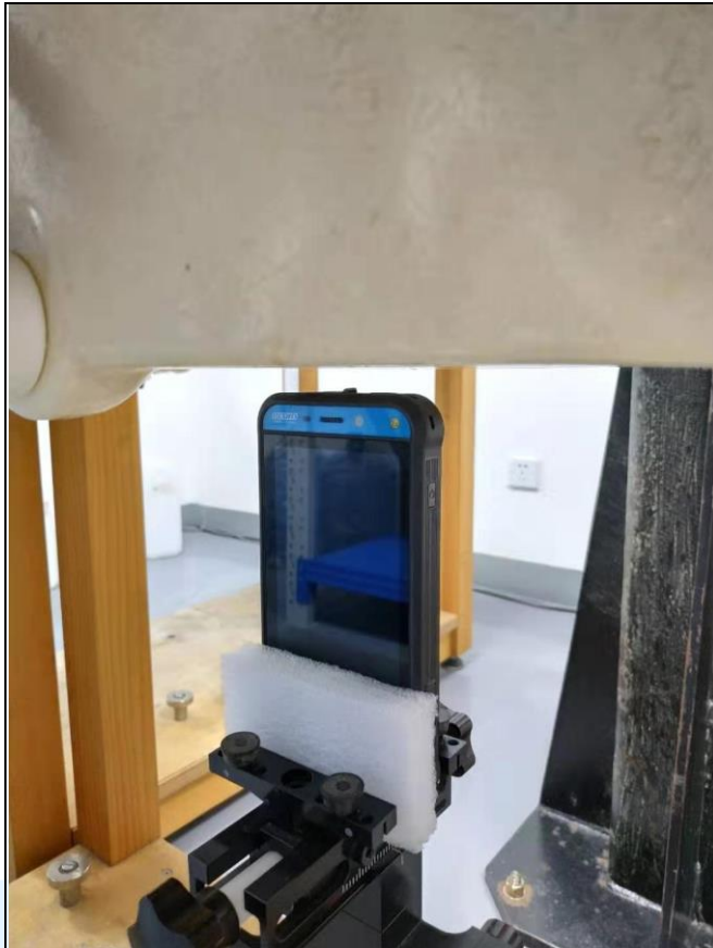
Top Side of EUT with 1.0 cm Gap