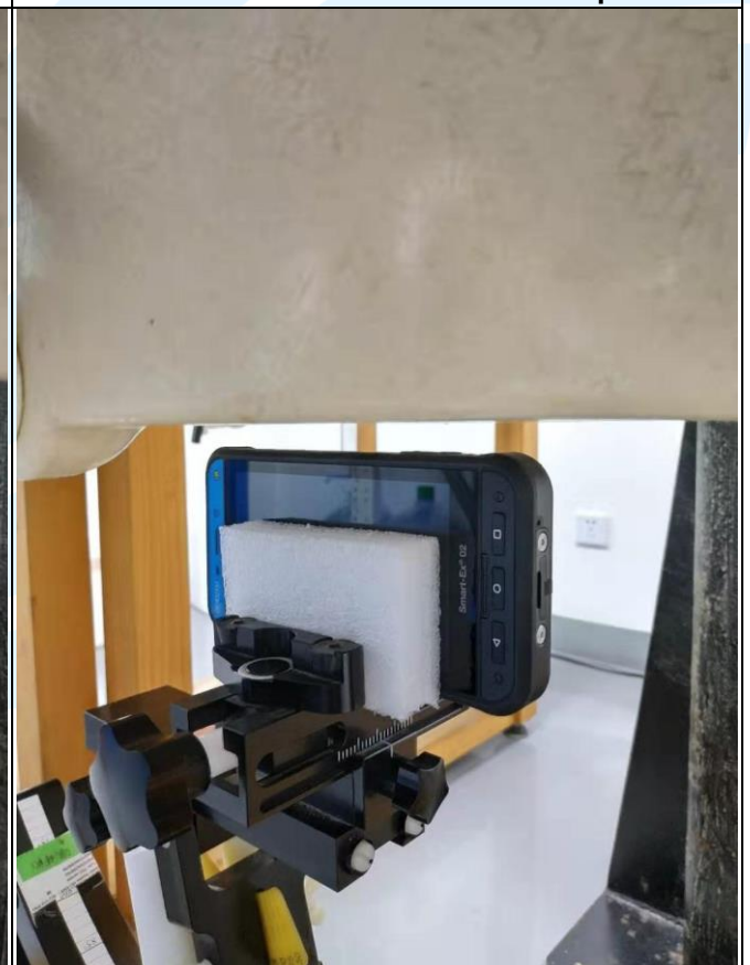
Right Side of EUT with 1.0 cm Gap