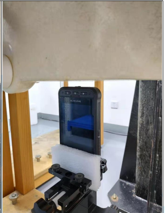
Bottom Side of EUT with 1.0 cm Gap