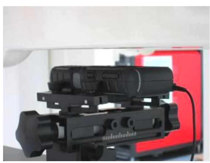
Front Face of EUT with 1.5 cm Gap