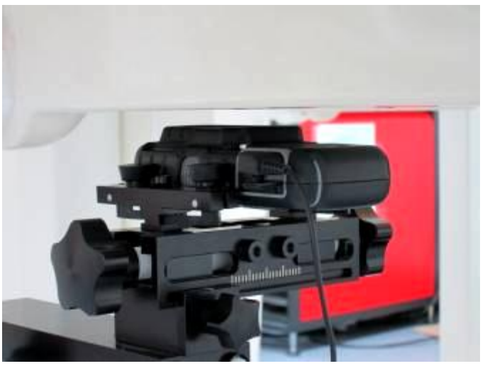
Rear Face of EUT with 1.5 cm Gap