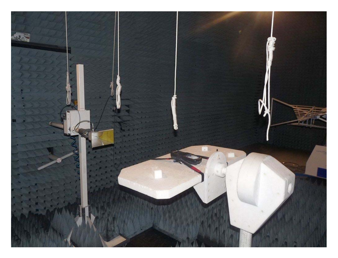
Photo 3: Test setup for radiated measurements (Enclosure, fully-anechoic chamber, 1-18 GHz intentional radiator §15 / 30 MHz – 10/20 GHz §22/24/27)