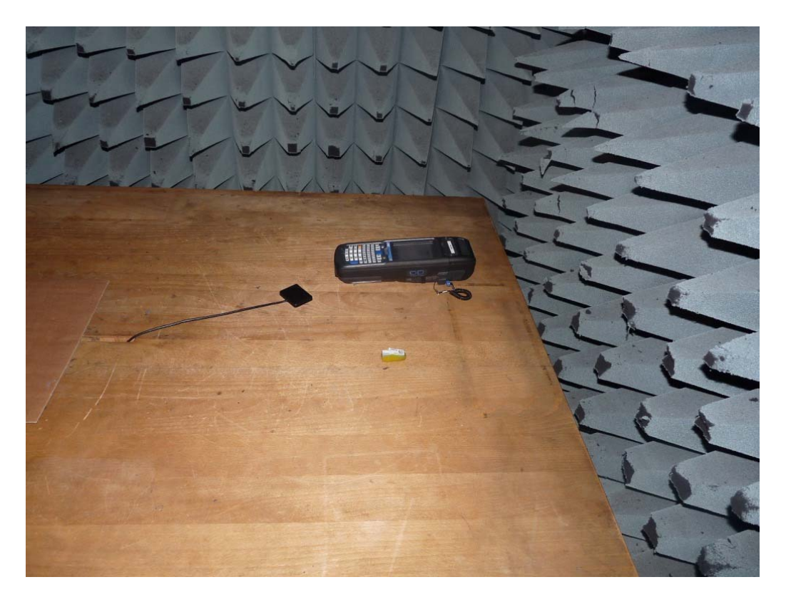
Photo 1: Test setup for radiated measurements (Enclosure, below 30 MHz, intentional radiator §15)