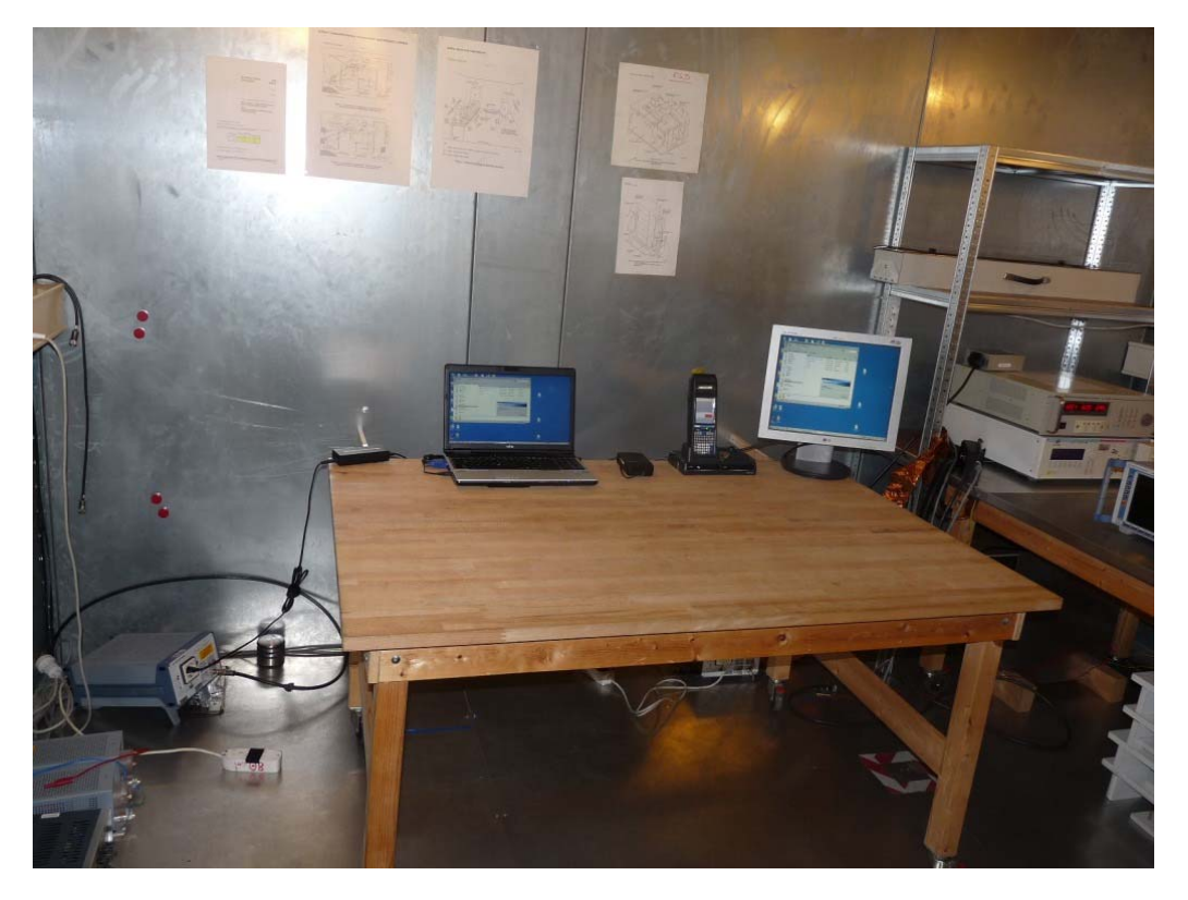
Photo 6: Test setup for conducted measurements (computer peripheral setup, EUT supplied by USB-cable from battery, unintentional radiator §15)