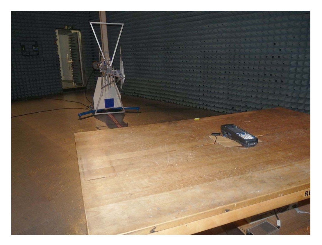
Photo 2: Test setup for radiated measurements (Enclosure, semi-anechoic chamber, 30 MHz to 1 GHz, intentional radiator §15)