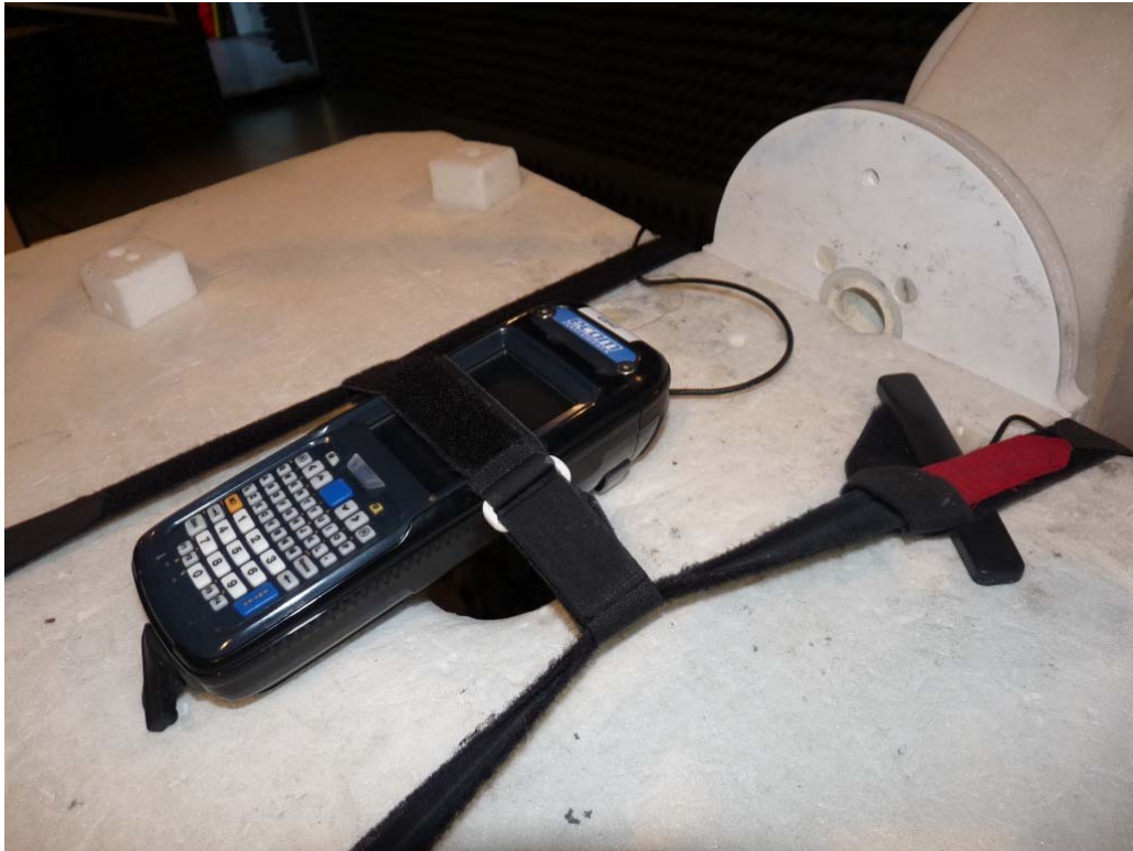
Device under test.