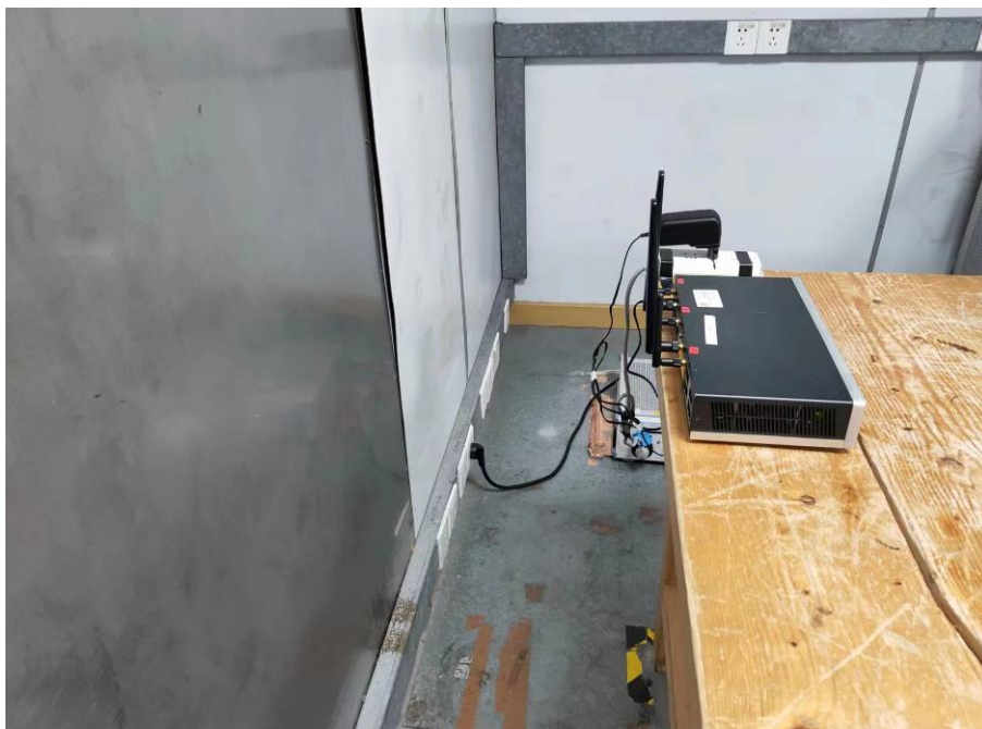
Photo of Conducted Emission Measurement