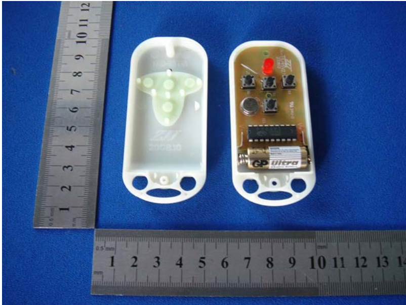
Photo 4 Appearance of PCB