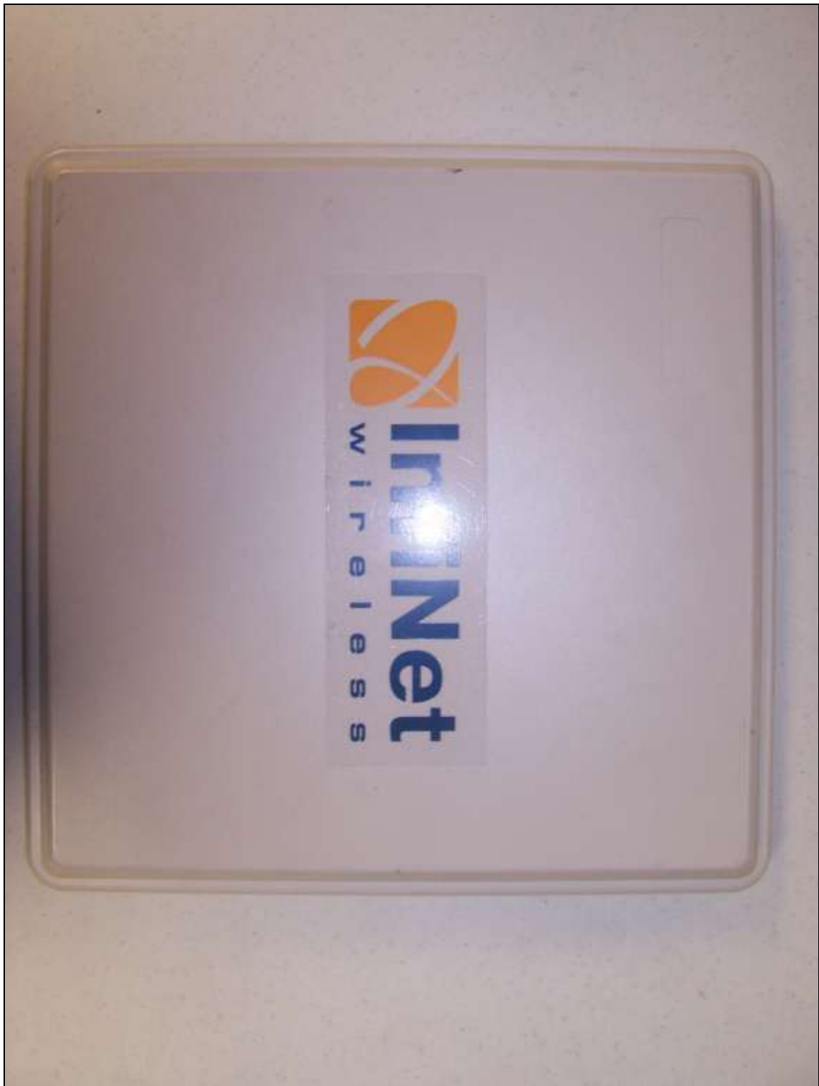
Photograph 1. 22 dBi Panel Front