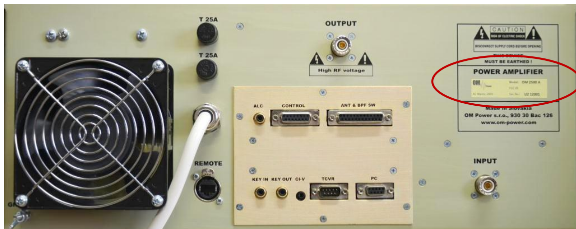
Fig.1 Label location

The actual label and its location on the equipment are shown in the following pictures.