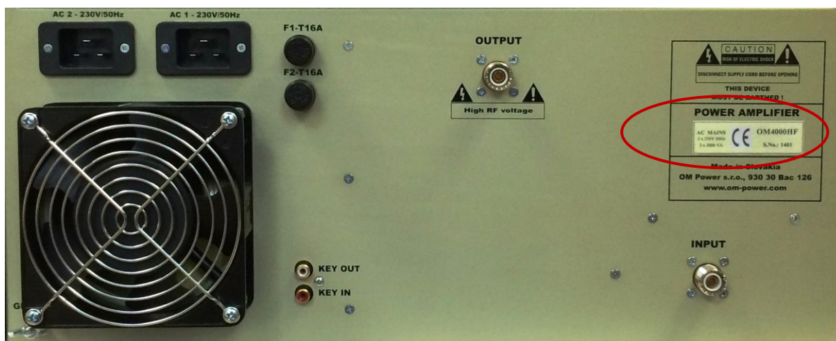
Fig.1 Label location

The actual label and its location on the equipment are shown in the following pictures.