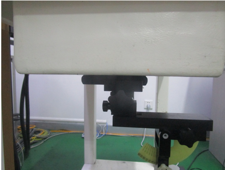
Body Right Setup Photo (0mm)