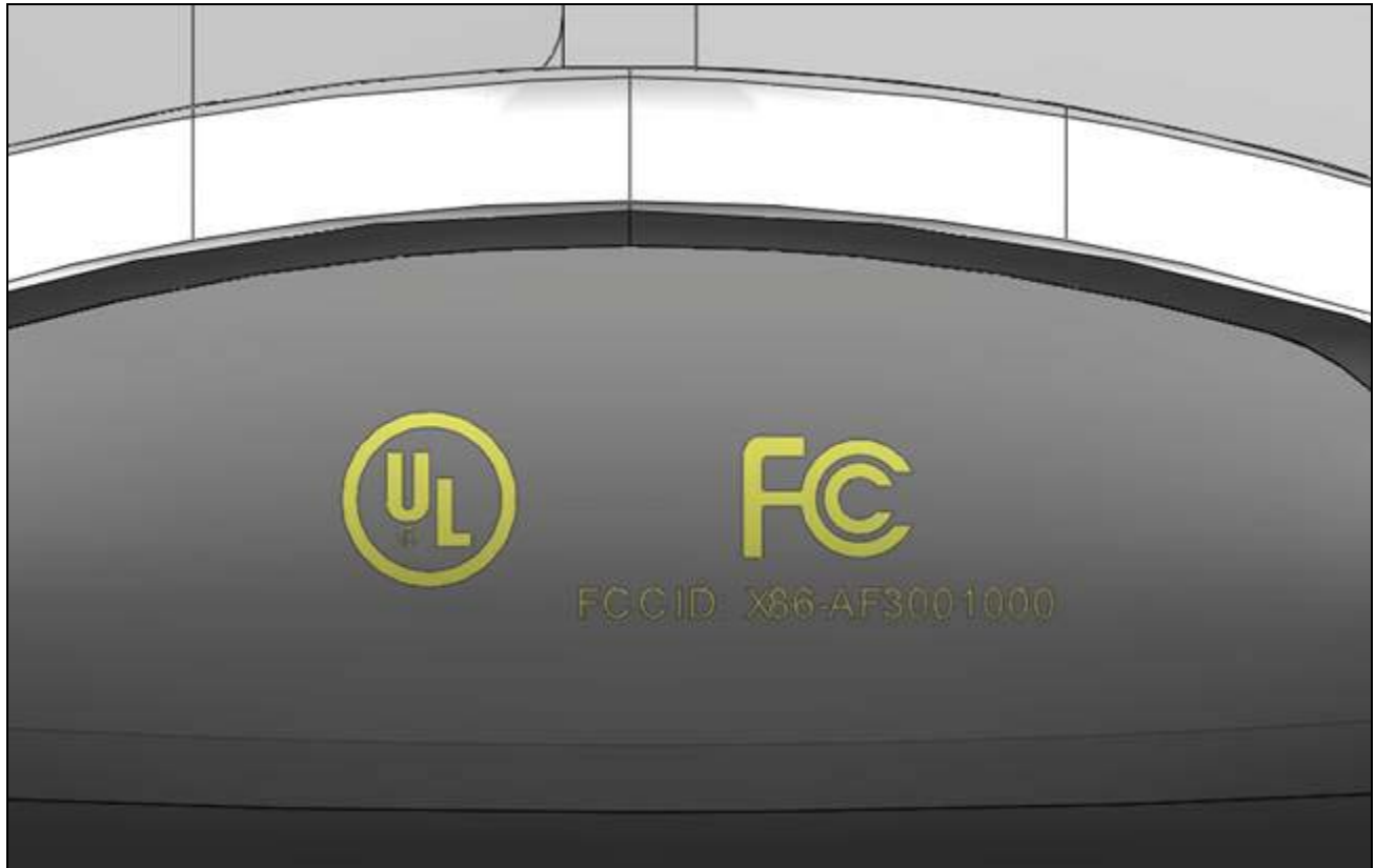
Photograph 1: ID Label