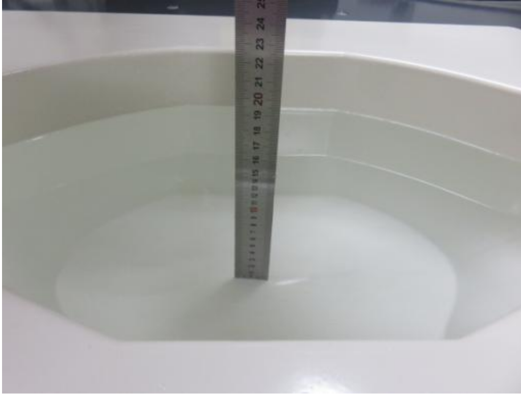
Photograph of the depth in the Body Phantom (1900MHz, 16.0cm depth)