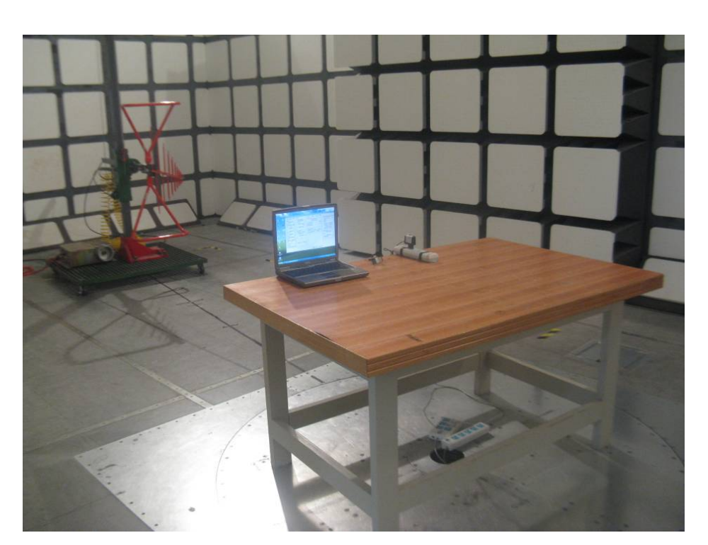
Below 1 GHz: Radiated Emissions - Front View