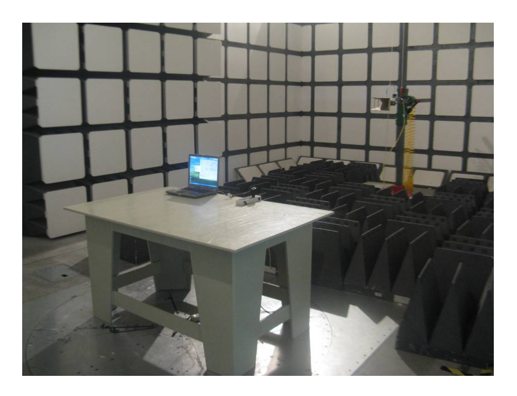
Above 1 GHz: Radiated Emissions - Rear View