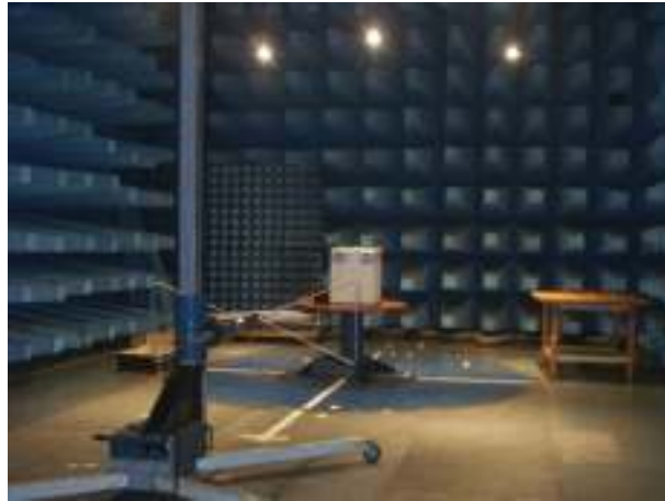
Log periodic antenna (30MHz ÷ 1000 MHz) measurement distance: 3 m