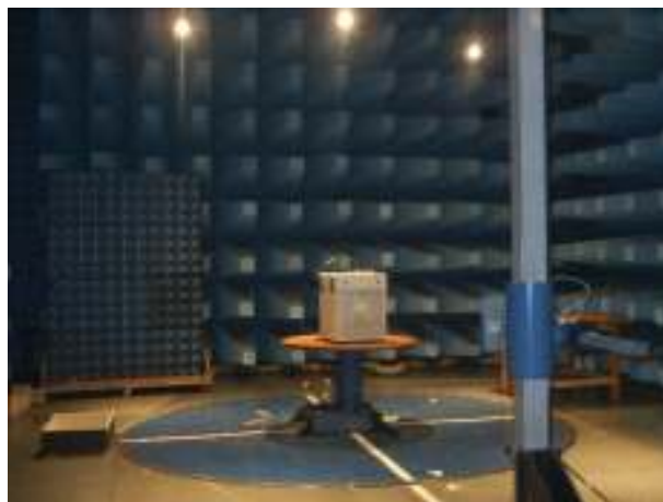
Log periodic antenna 1000 MHz ÷ 10000 MHz) measurement distance: 3 m